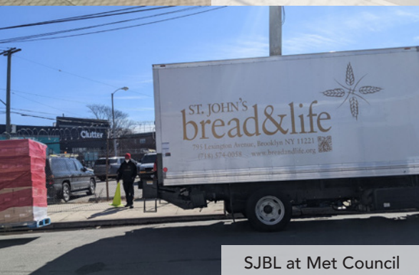
SJBL at Met Council