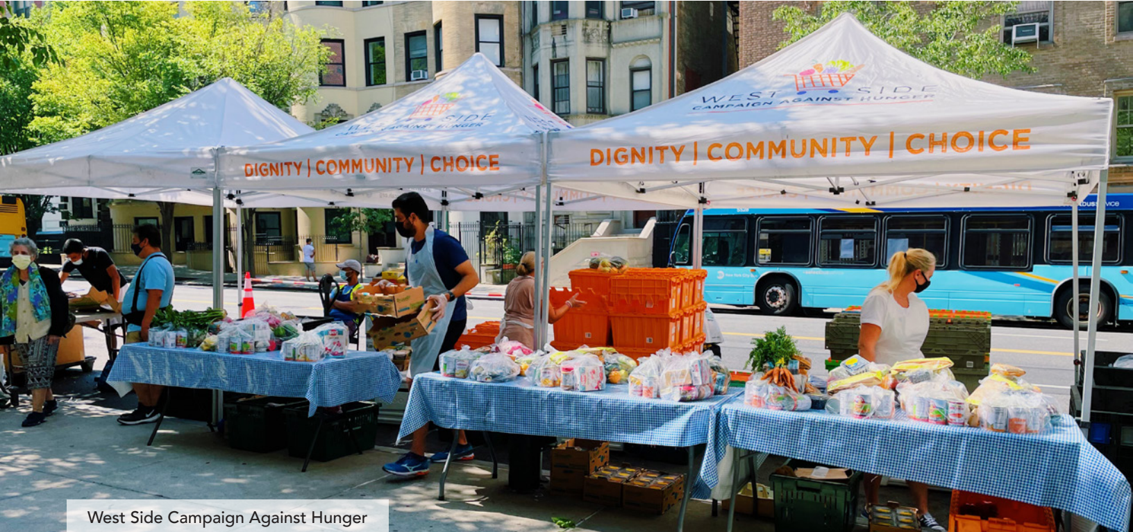
West Side Campaign Against Hunger