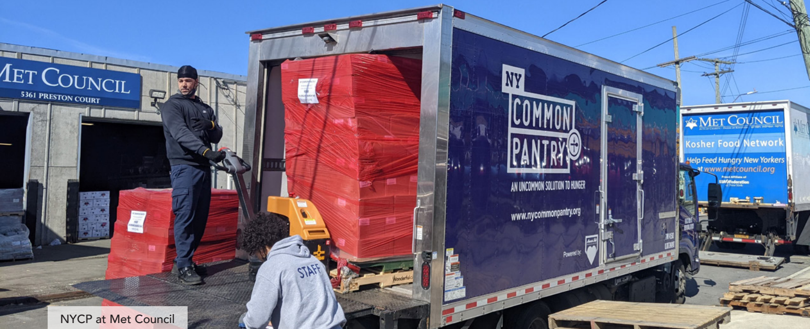
NYCP at Met Council

The Roundtable’s first bulk purchase order of a trailer of oats saved 50%, or nearly $28,000 , compared to what Roundtable organizations would have paid to a traditional distributor.