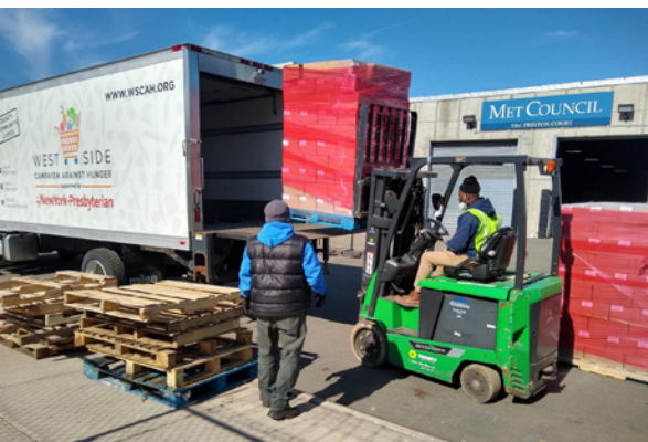
WSCAH at Met Council

As the Roundtable looks ahead to continued strategic purchasing efforts, members are in agreement that they are ready to begin setting up standing orders for additional staple goods, such as shelf-stable milk, peanut butter, cooking oil, and diapers, and are excitedly setting themselves on the path to more fully capitalizing on their shared experiences of cooperation.