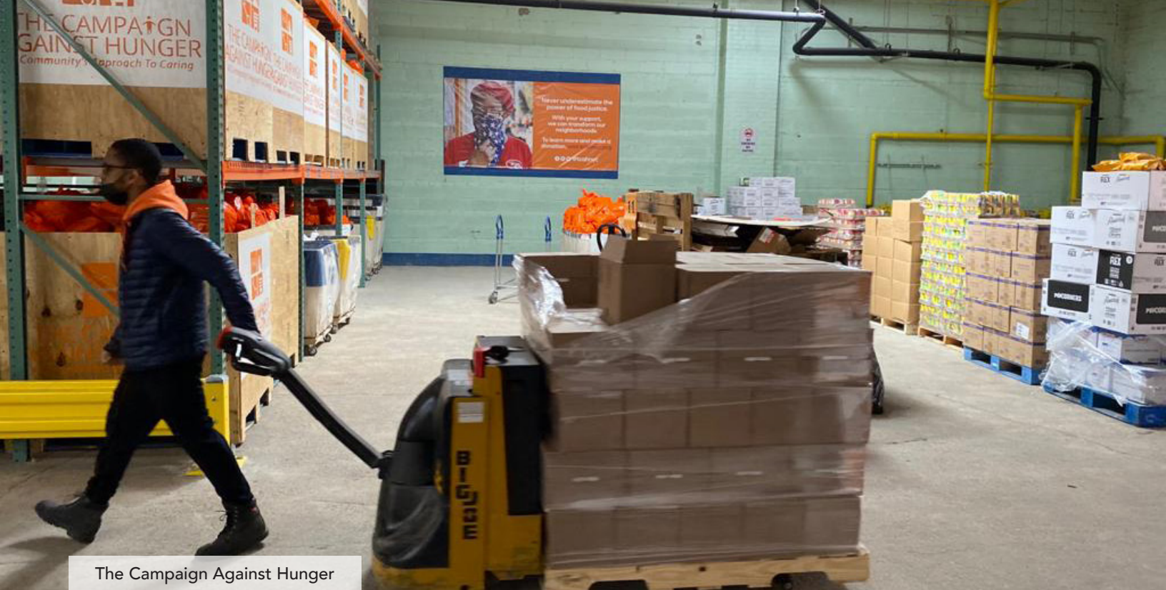
The Campaign Against Hunger

“To Holy Apostles, the biggest success of the Roundtable has been our collective buying and bargaining abilities. Being able to purchase food in bulk for a lower price has significantly impacted our organization.”