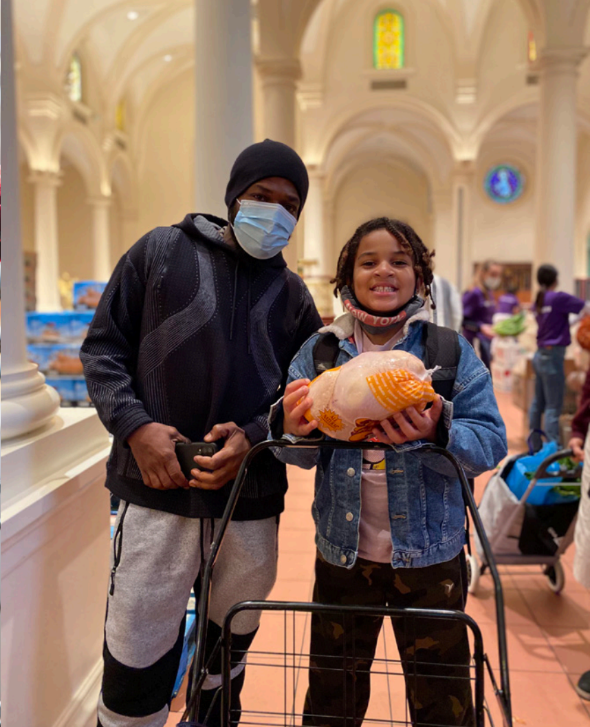
Part of the Solution (L), Holy Apostles Soup Kitchen (R)

“Besides the monetary benefit of the savings, the Roundtable has really helped shine a light on the value that emergency food providers bring to local communities.”