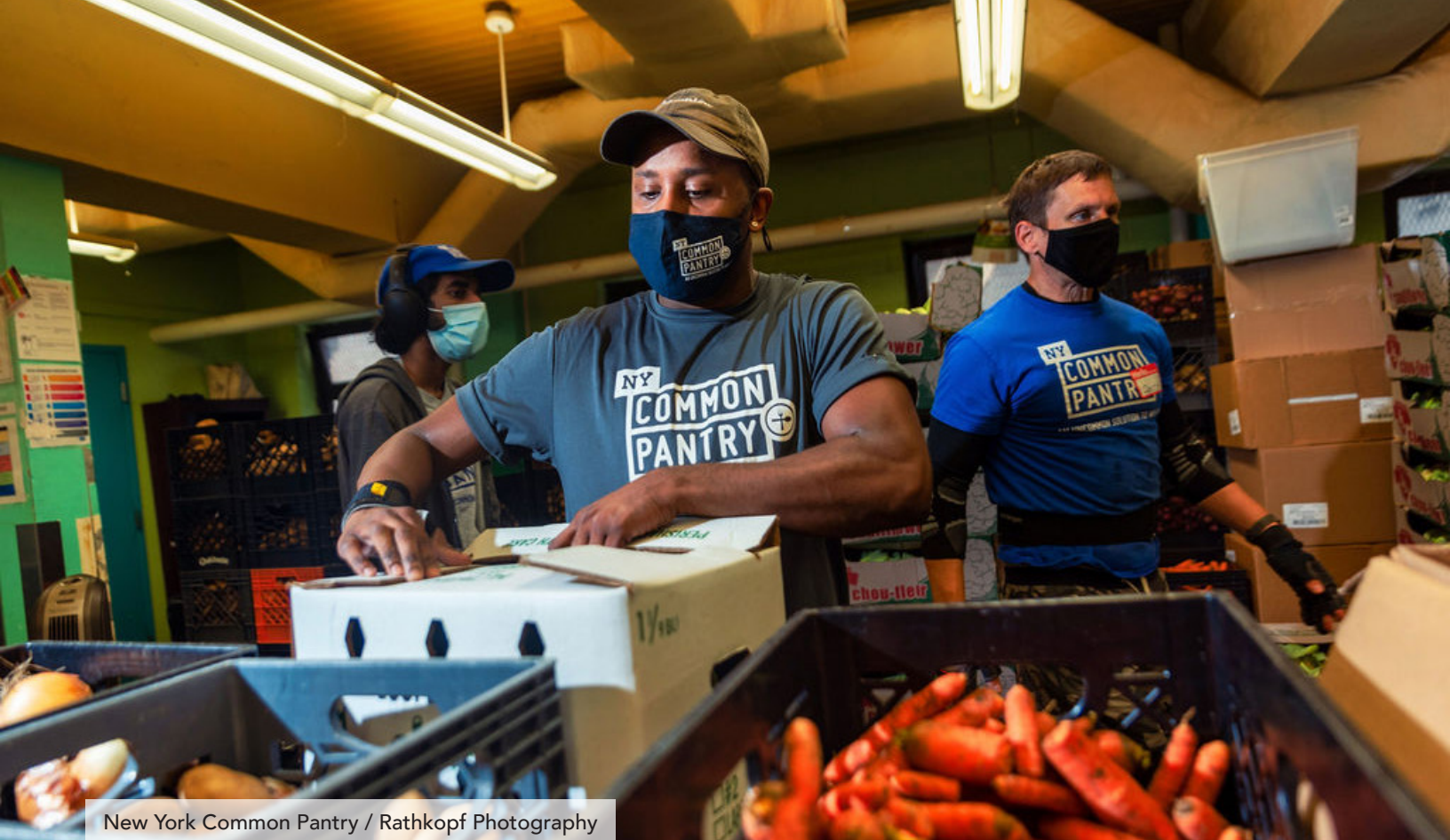
New York Common Pantry / Rathkopf Photography