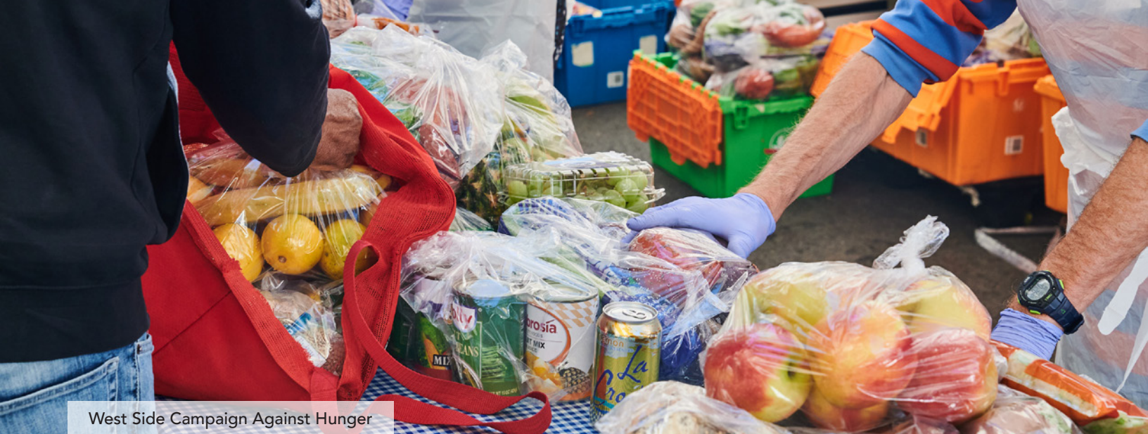
West Side Campaign Against Hunger