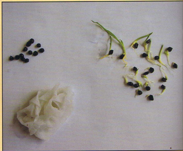
▲ These seeds were refrigerated dry for four weeks followed by four weeks on a dampened coffee filter at room temperature. Compare with the next image.

By Susan Bergeron, ODH Region 4, Ontario, Canada