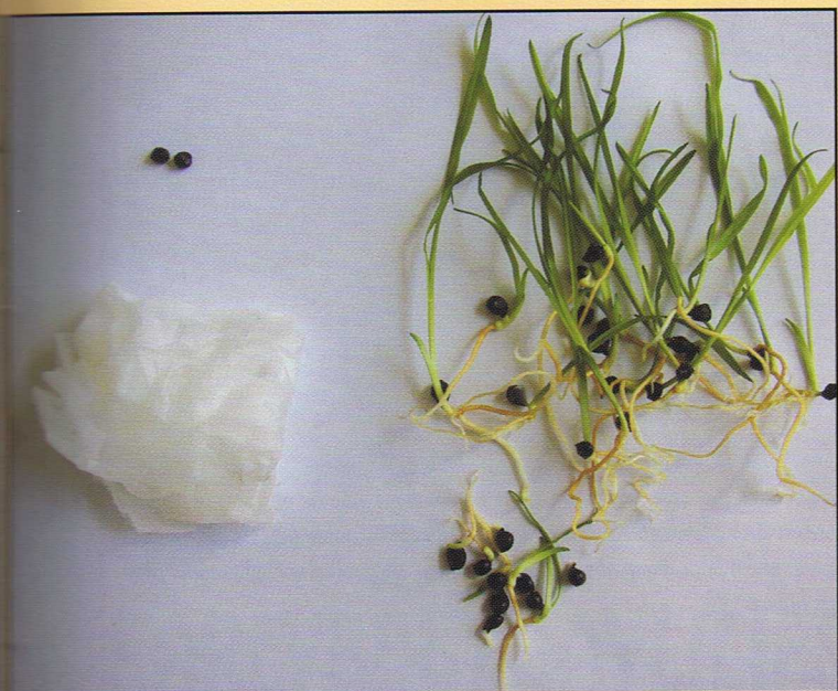
▲ These seeds were refrigerated on a damp coffee filter for four weeks followed by four weeks at room temperature. A much higher germination and more growth is seen than those refrigerated dry as seen in previous photo. But compare these with...