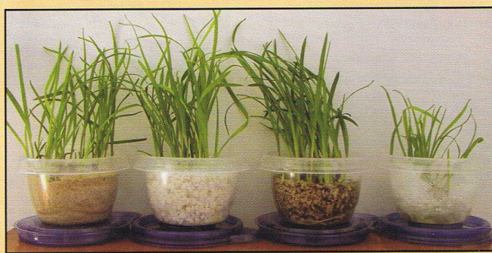
▲ Seeds are shown stratified in various dampened media for one month and pictured one month after removal from refrigerator. Left to right: sand, perlite, vermiculite, and coffee filter. Germination was 97 percent except for those on coffee filter at 93 percent. Damp coffee filter seedlings were also smaller.

When someone says they had a low germination percentage with their particular seed starting method, ask at what length of time after sowing the percentage was calculated. For instance was it after two weeks, four weeks, two months or six months? The number of seeds that germinate may increase over time if the seeds aren’t