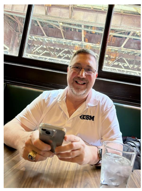
"Never not working"

As we have grown and stretched our limits – some may argue overextended – we have learned and improved ourselves. What began as a stray idea at the beginning of the pandemic has grown into a team of eleven employees and regular contributors – we truly couldn't do it without them. Our global reach now spans 33 countries and four continents. ExoConsulting's three divisions represent over twenty football (soccer) players, seven race car drivers, five coaches, three race teams, two weather companies, and an eSports platform – no, we don't have a "partridge in a pear tree."