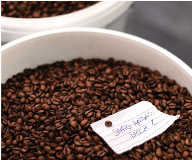
LEFT Roasted coffee.