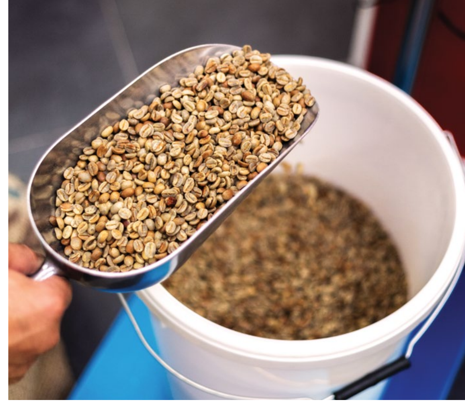
Scooping and weighing green coffee.

● Fixed Batch Size: With a fixed batch size, a roaster will use the same batch size roast after roast. You can use one batch size for all coffees (i.e., always roasting 4 kilos in a 5-kilo machine). Or you can keep a consistent batch size for each coffee but use different batch sizes for different coffees (for example, always roasting Colombian coffees in 10-kilo batches, Ethiopian coffees in 11-kilo batches, etc.). Using a fixed batch size helps maintain consistency, limits roasting variables, and allows the roaster to tweak other aspects of the roast. The main downside is that you might end up with overage (i.e., roast more coffee than you need). If you get an order for 2 kilos of a coffee but your batch size is set to 4 kilos, you will end up with twice as much coffee as you need. If you have an outlet for this coffee, this is no problem. At Huckleberry, Williamson mentioned a “Coffee Club”