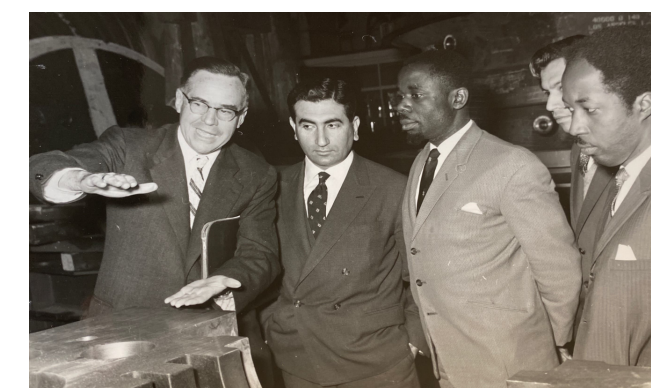
Carnegie Fellows visiting a Swiss factory in 1961

Such visits were important for the experience of place and well as for meeting people. Place mattered to the construction and transmission of diplomatic knowledge, and the qualities of these places - the hospitality of the host city, the offices of international institutions, the conference rooms of multilateral negotiation - to our understanding of the where of diplomatic practice as well as the what and how.