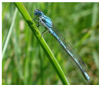
Common blue damselfly