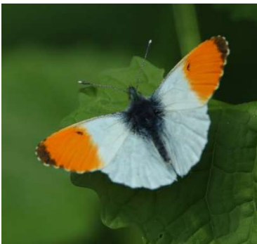
Orange tip butterfly