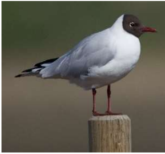
Black headed gull