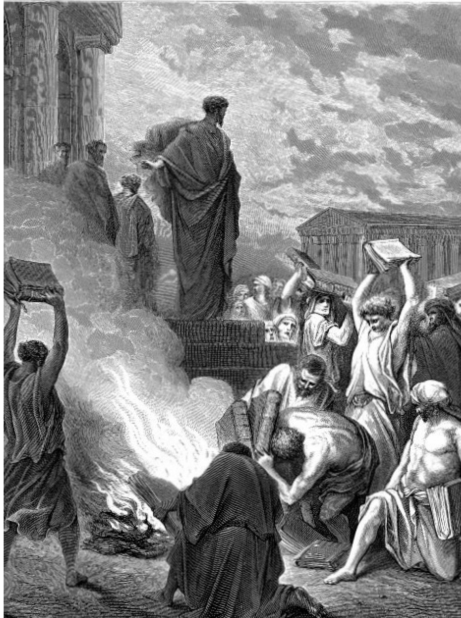
"St. Paul at Ephesus" by Gustave Doré