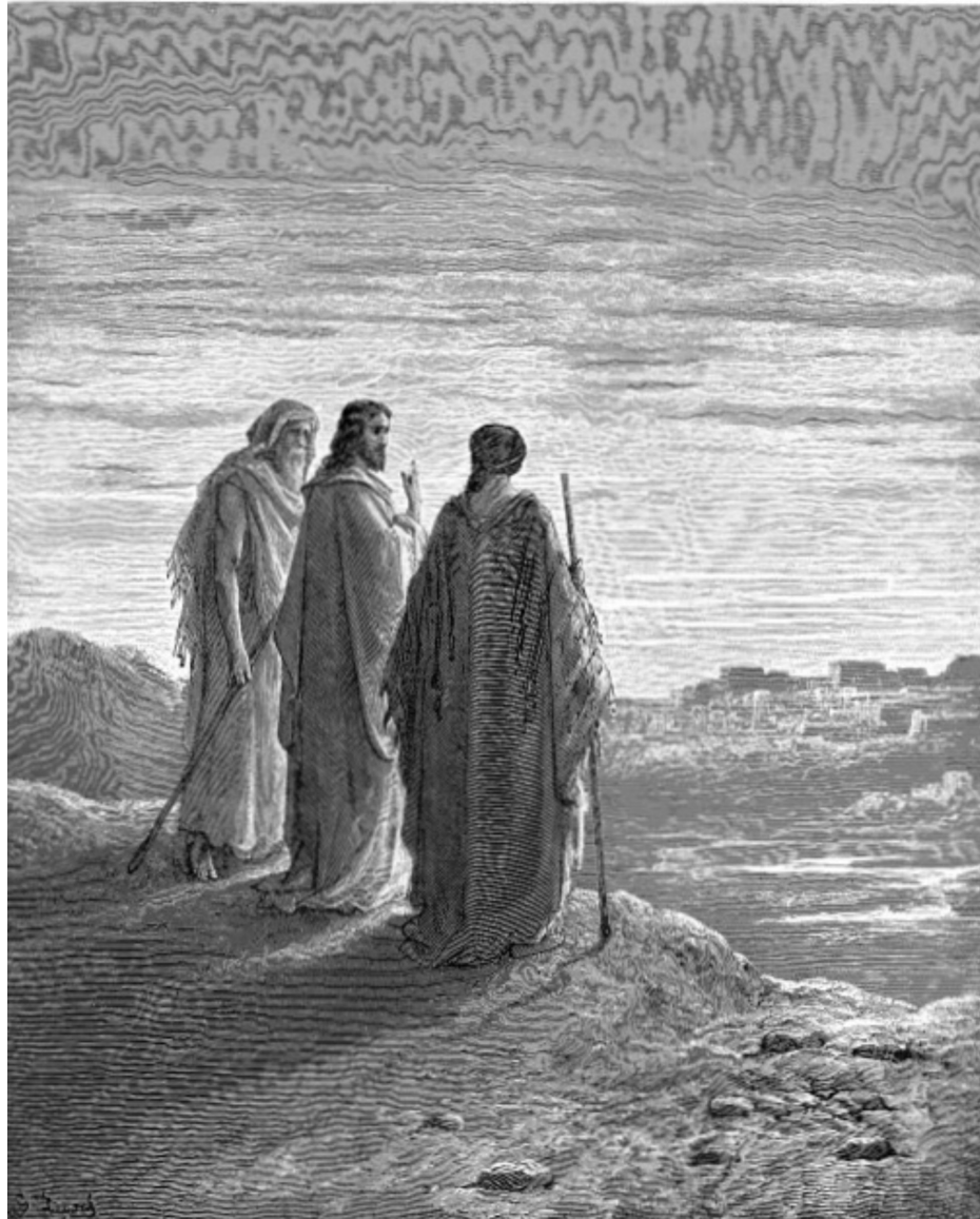
"Jesus and the Disciples Going to Emmaus" by Gustave Doré