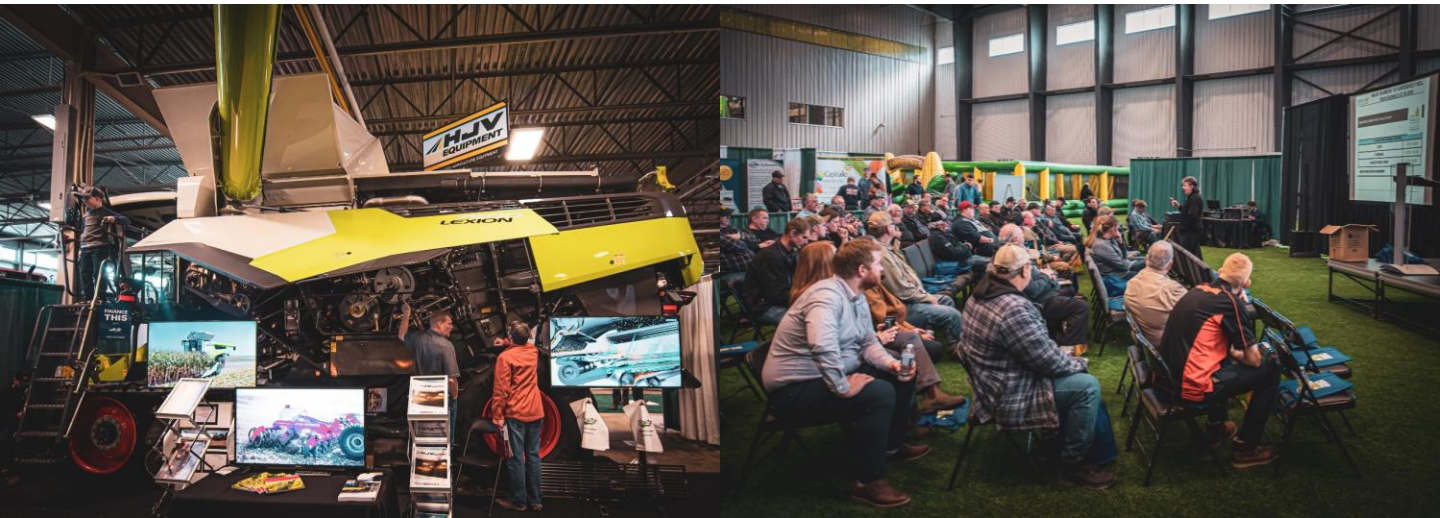
Why farmers attend our show*: