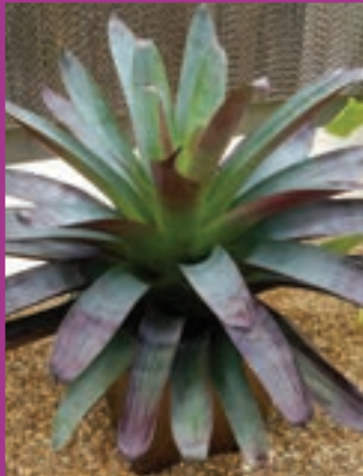
Vriecantarea Julietta PAT#26259