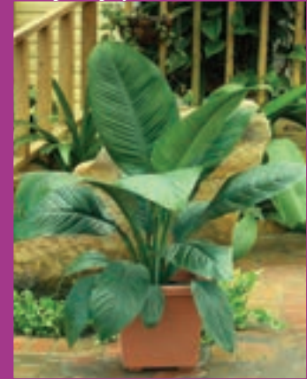
Spathiphyllum Sensation ®