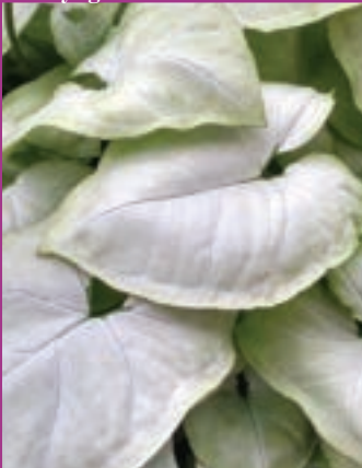
Syngonium Moonshine ™