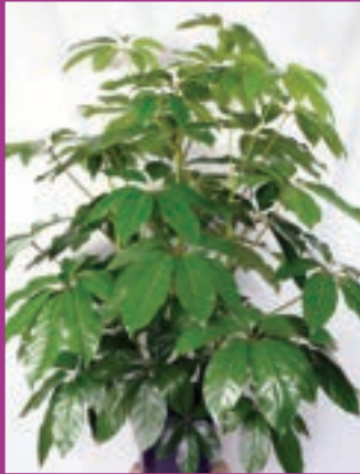
Schefflera Amate ®