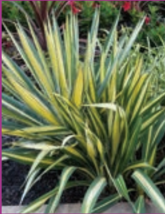
Yucca Color Guard