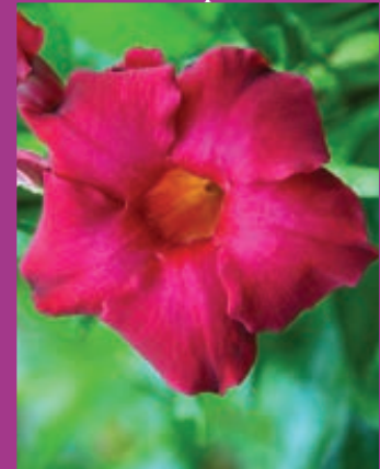
Raspberry Kiss PAT#31869