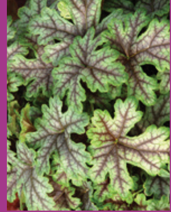
Heucherella Tapestry PAT#21150