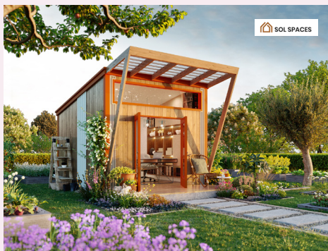
Sol Spaces “Sol Studio”