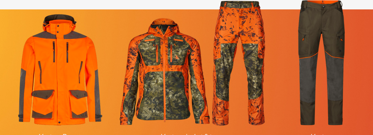
Vantage jacket & trous

When the forecast is unpredictable but the hunt is expected to be fast-paced, our AW23 line features specialized styles for driven hunting and dog handling, offering hunters a unique edge in the field. These heavy-duty ripstop styles are meticulously crafted to enhance visibility, promote agility and ensure optimal performance. With strategic placement of pockets, reinforced stitching and advanced fabric technologies, our driven hunt styles provide the necessary tools for success while exuding undeniable coolness and confidence.