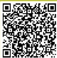
M12 - Material English/Italian