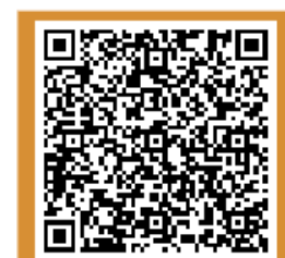
M13 - Synopsis English