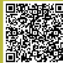
M1 - Facilitator Notes English

PROBLEM WITH THE LINK? CONTACT US! INFO@SWIDEAS.SE