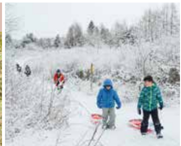
FIELD TRIPS & AFTERSCHOOL