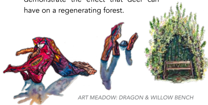
ART MEADOW: DRAGON & WILLOW BENCH