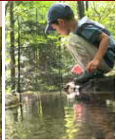
CAMPS & FOREST PRESCHOOL