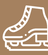
Figure Skating and Hockey