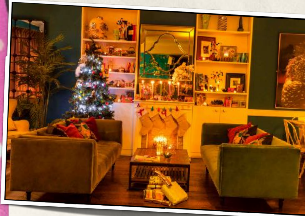
The Little Yellow Door