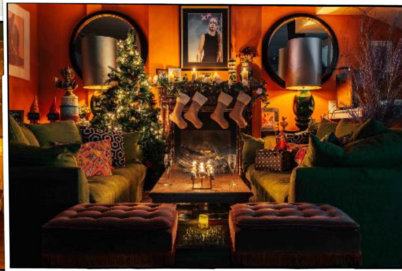
The Little Orange Door