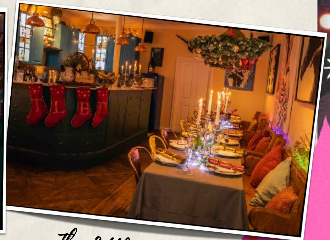
The Little Blue Door