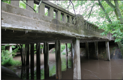
2012 Abandoned westbound bridge