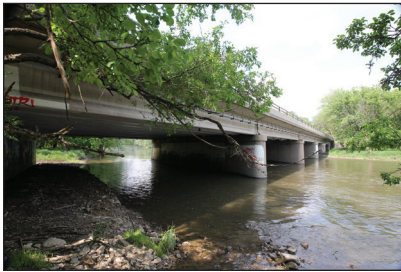
2013 view of 1996 rehabilitation

NOTE: Acknowledgment of lost bridges on Lily Cache Creek in Plainfield here: 41.632906,-88.167663 and on the DuPage River in Plainfield here: 41.571222,-88.200711 and here: 41.519889,-88.198577