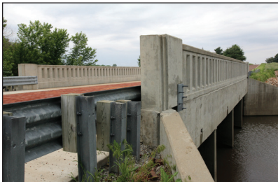
2013 view of the 2002 bridge