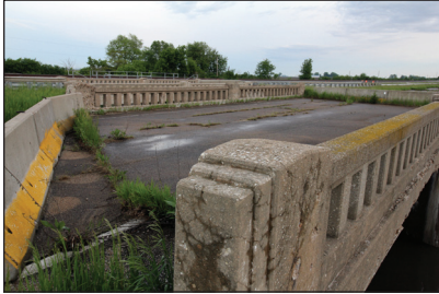
2013 (the closed 1943 WB bridge)

Date Built: EB (No. 053-0003) = 1940 (replaced an earlier bridge on a dangerous curve); rebuilt in 1997; WB (No. 053-0004) = 1946 for the 4-lane expansion; closed in 1998.