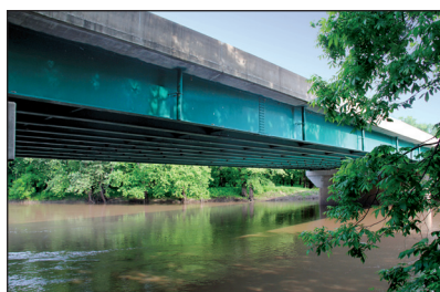
2013 Reconstructed bridge