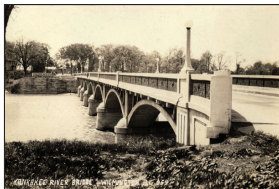
1930s Concrete Arch