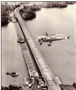
1932 Lake Springfield Bridge (right side of photo) and 1967 EB I-55 bridge under construction

Note: In 1967, the 1932 bridge was adopted by WB I-55. The 1967 EB bridge was built for the interstate.