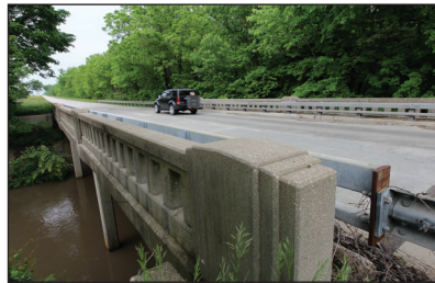
2012 Eastbound bridge