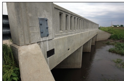
2013 view of 2002 bridge