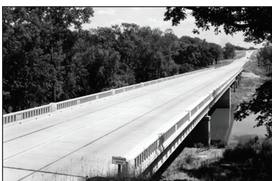
IDOT photo of 1936 bridge

Note: IDOT bridge report lists 1926 date in error; IL Historic Registry and other sources list 1936.