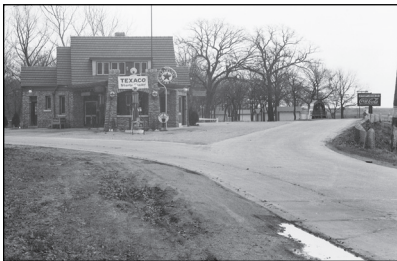
Bridge in right center of photo.

31. Lost bridge or culvert on Tupelo Creek on Mingo Rd. north of 11 th St. in Tulsa.