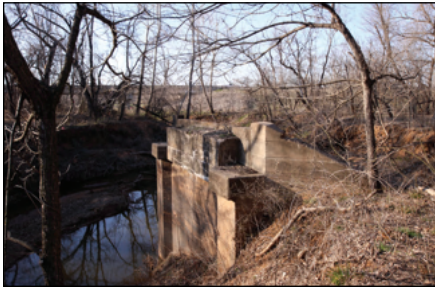
Original site of truss bridge (2008 photo)

Coordinates: 1926 location: 35.806877,-96.494621; 1928 location: 35.806896, -96.494549