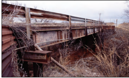
1994 (West Bridge)

NOTE: Acknowledgment of a large Concrete Culvert approx. ½ mi. west of Liberty Ln. in Elk City (1929 route), soon after the beginning of the divided 4-lane, located here: 35.411709,-99.452079