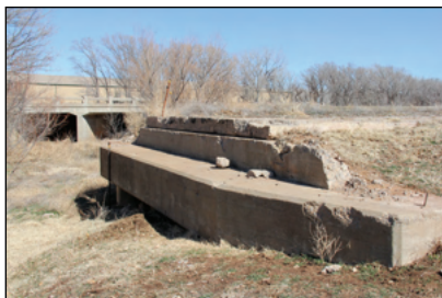
2013 (west abutments)