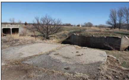
2013 (east abutments)

Coordinates: 35.218728,-99.93868 (East abutments); 35.21875,-99.943298 (West abutments).