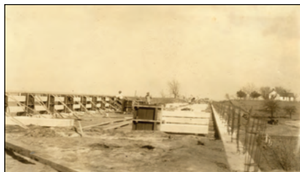
ODOT photo during 1933 construction

127. Steel Stringer on the 1934 route .75 mi. west of the US 281 turnoff to Hinton.