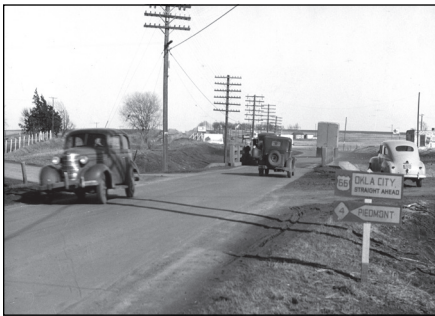
ODOT photo circa 1949 prior to replacement

110. Twin bridges on Shell Creek on the 1951 4-lane alignment west of Yukon.