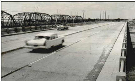
circa 1959