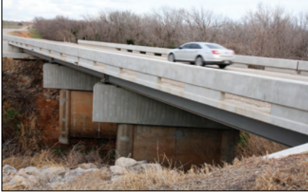
2013 (eastbound bridge)

142. Lost steel truss bridge on the Washita River at Clinton.