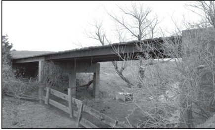
1994 (East Bridge)

Coordinates: 35.305889,-99.605797 (East bridge); 35.305871,-99.609885 (West bridge).