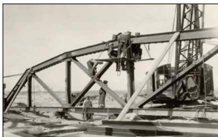
1932 ODOT photo