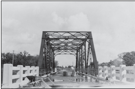
ODOT photo of 1928 bridge