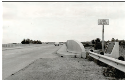
circa 1959

NOTE: DRAINAGE STRUCTURES ON THE 1926-1928 ROUTE FROM SAYRE TO TEXOLA ON THE OLD POSTAL ROUTE WERE BUILT AFTER 1928 BY THE WPA, WITH THE EXCEPTION OF THE SHORT BRIDGE LISTED BELOW.