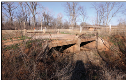
West bridge (2013)

62. Lost Catfish Creek Bridge on the upgrade route (SH 66) west of Bristow. Date Built: 1940; replaced an existing bridge. Type: Unknown Status: GONE. Replaced by a Precast Concrete Girder bridge in 1995. Coordinates: 35.820184,-96.412178 Note: Current bridge is named the "SFC Donald J. Hurt Memorial Bridge." Photo Unavailable