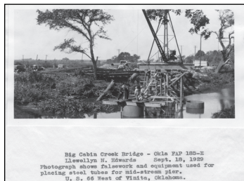
1929 bridge construction