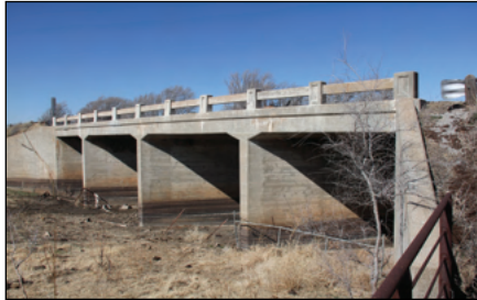
2013 (eastbound bridge)

169. Large Culvert underneath the 4-lane route west of the entry above.