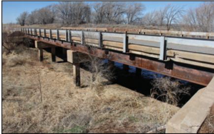
2013 (westbound bridge)