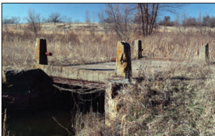
East bridge (1996)

61. Two short bridges on the abandoned segment of the 1926-1928 route west of Bristow. Date Built: circa early-1920s. Type: East: Steel Beam with stone abutments, concrete and pipe guardrails; West = Concrete Culvert with guardrails. Status: Abandoned; on private property. Coordinates: E = 35.813632,-96.452065; W = 35.81472,-96.456639