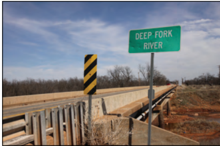
2013 photo of the 1952 bridge

Date Built: 1951; may have replaced a bridge of unknown date and type.