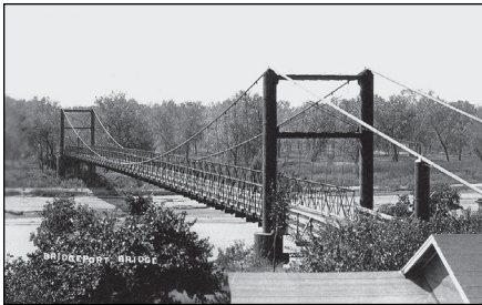
Kathy Anderson Collection

121. Lost Suspension bridge on the South Canadian River north of Bridgeport. Date Built: 1921 by businessman George Key as a toll bridge. Known as the Key Bridge. Type: One-lane Steel Suspension bridge with a timber deck (1000 feet in suspension). Status: GONE. Bypassed with a new bridge downstream in 1934; demolished in 1952 following a fire. Coordinates: 35.567124,-98.374688