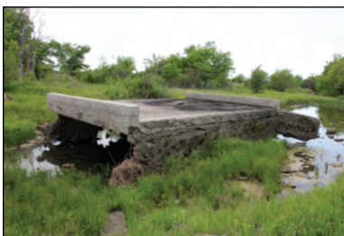
Short bridge SW of Delaware Co. Line

Note: A culvert ruin exists 700' north of the bridge here: 36.667144, -94.999416. Approx. 2/3 of a mile to the south there was a 1919 culvert, also on the Blue Book route; now buried: 36.656135, -94.999377