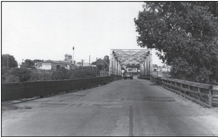
ODOT photo (1940s)