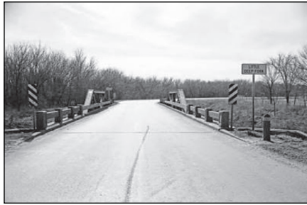
Site of truss bridge after its relocation in 1928

64. Bridge at the east end of Depew on SH 66 (final alignment).