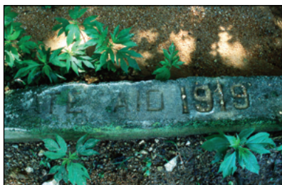
1993 (culvert dated 1919; now buried)