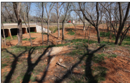
2013 (Path of original route near Main St.)