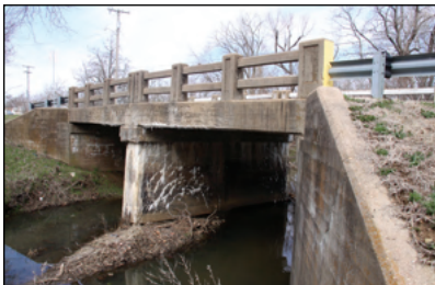
1941 bridge on 1st St. in Chelsea (2013 photo)

NOTE: Acknowledgment of a 1958 Concrete Culvert at the west edge of Chelsea built for the 4-lane project, which may have replaced a culvert or bridge on the 2-lane route. 36.5275,-95.435398