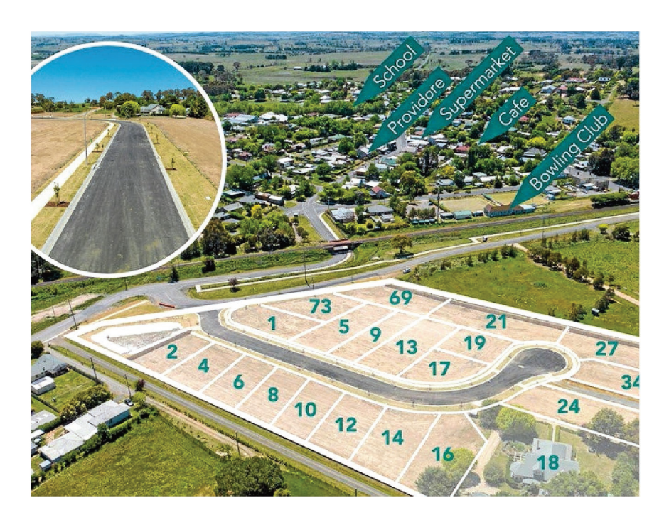
\label{thm:model} \mbox{Historic Millthorpe village has a new offering, with 20 lots up for grabs and ready to be built on.

Starting from the mid $300,000 range, Mr Snowden says while there aren't any restrictions on style of home per se, there is a desire to