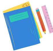
taking care of school supplies