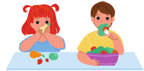
not wasting food