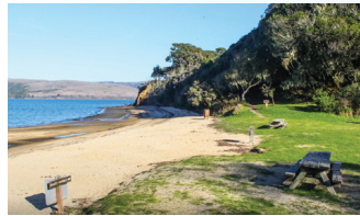
Heart's Desire Beach

Would like to let our customers know about some local alternative places to gather with family and friends. Please pack a picnic basket, bring your cooler, come fill it with oysters, and head to the beaches and parks!