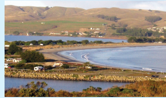
Doran Regional Park

SOUTH BEACH: (One hour) Take a right onto Sir Francis Drake Road just south of Point Reyes Station. Take South Beach Road .7 miles to the beach)