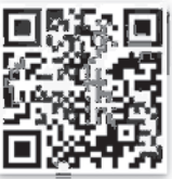
The Real McCoy Documentary

In January 1920, when Prohibition began, Cpt. Bill McCoy was the first to fill his boat, Arctusa , with rum in the Caribbean, sail up the East Coast, and act as a floating liquor store—legally—as he stayed three miles offshore in international waters.