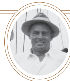
THE REAL MCCOY

A respected shipwright & sailor, McCoy was a gentleman rumrunner and lived by a code of honor—never adulterating his product.