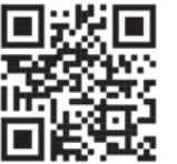
Charles W. Morgan Documentary