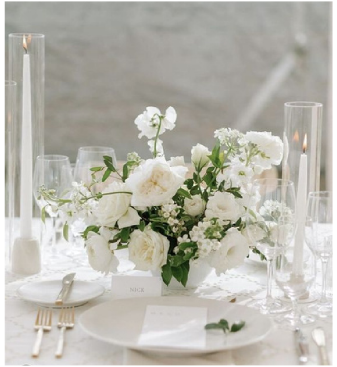
MEDIUM CENTERPIECES $125 EACH