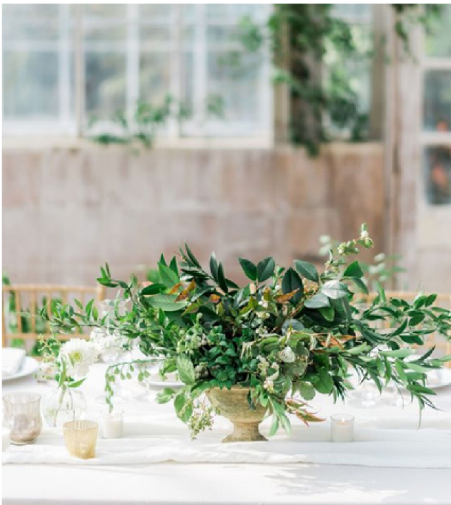
LARGE CENTERPIECES $225 EACH