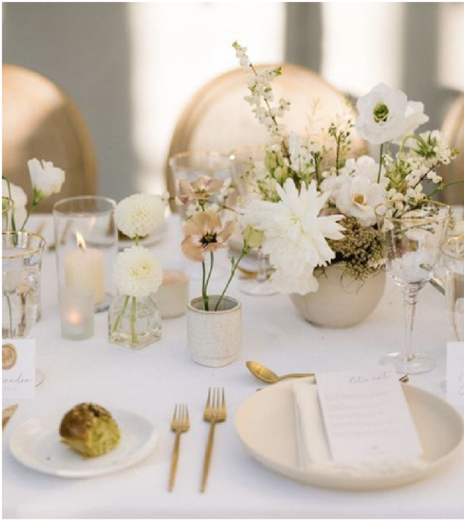
SMALL ARRANGEMENTS $65 EACH