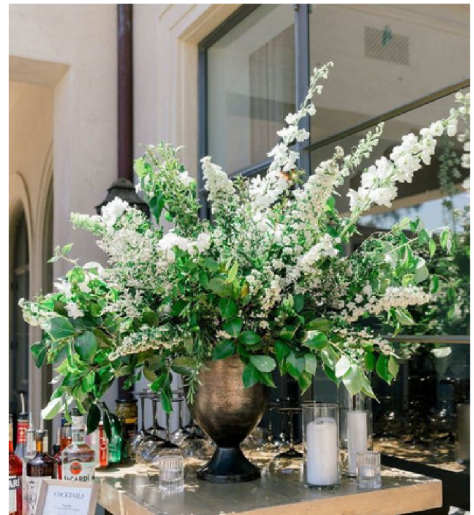
LARGE BAR ARRANGEMENT $400