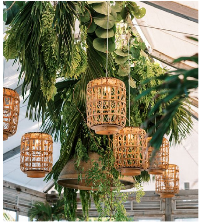
INSTALLATION WORK AVAILABLE