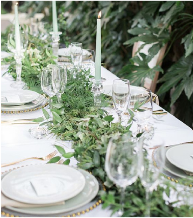
FRESH GREEN GARLAND $35/FT