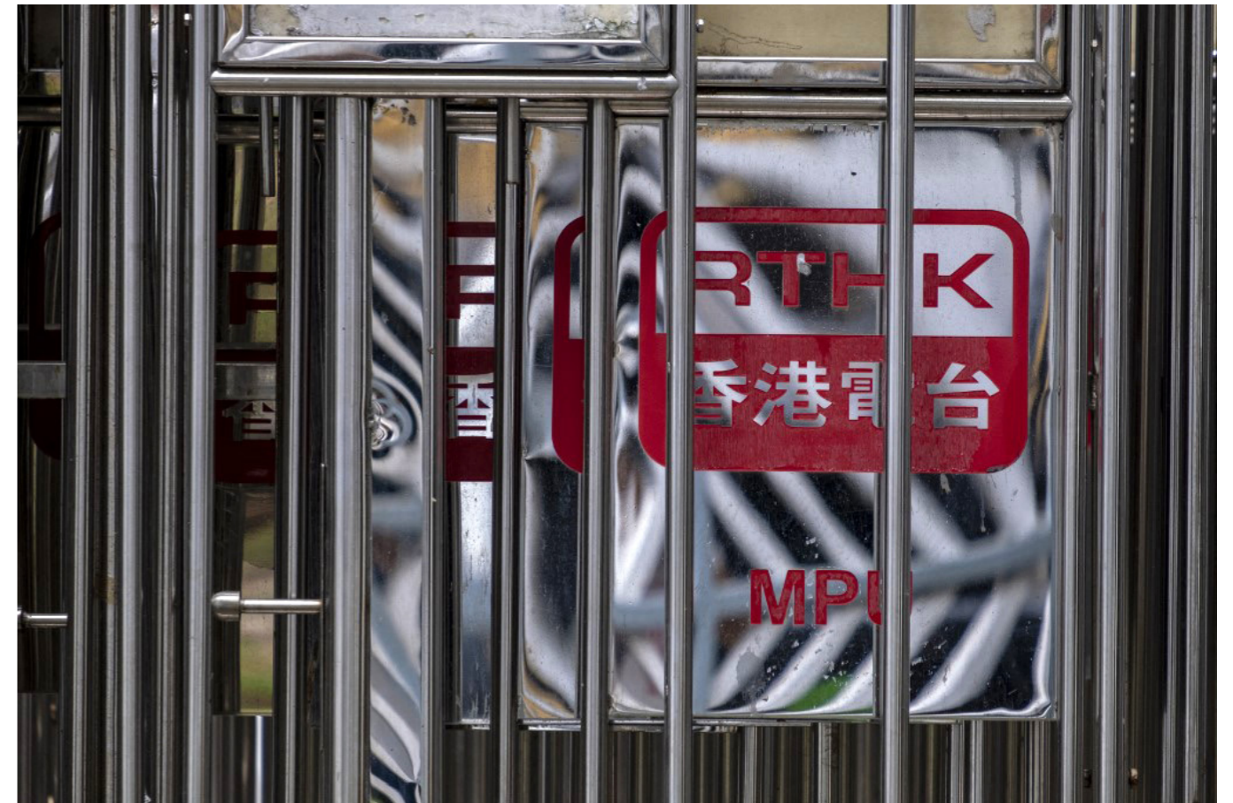
A Barricade with an RTHK logo at RTHK Television House in Hong Kong, China on April 20, 2021.