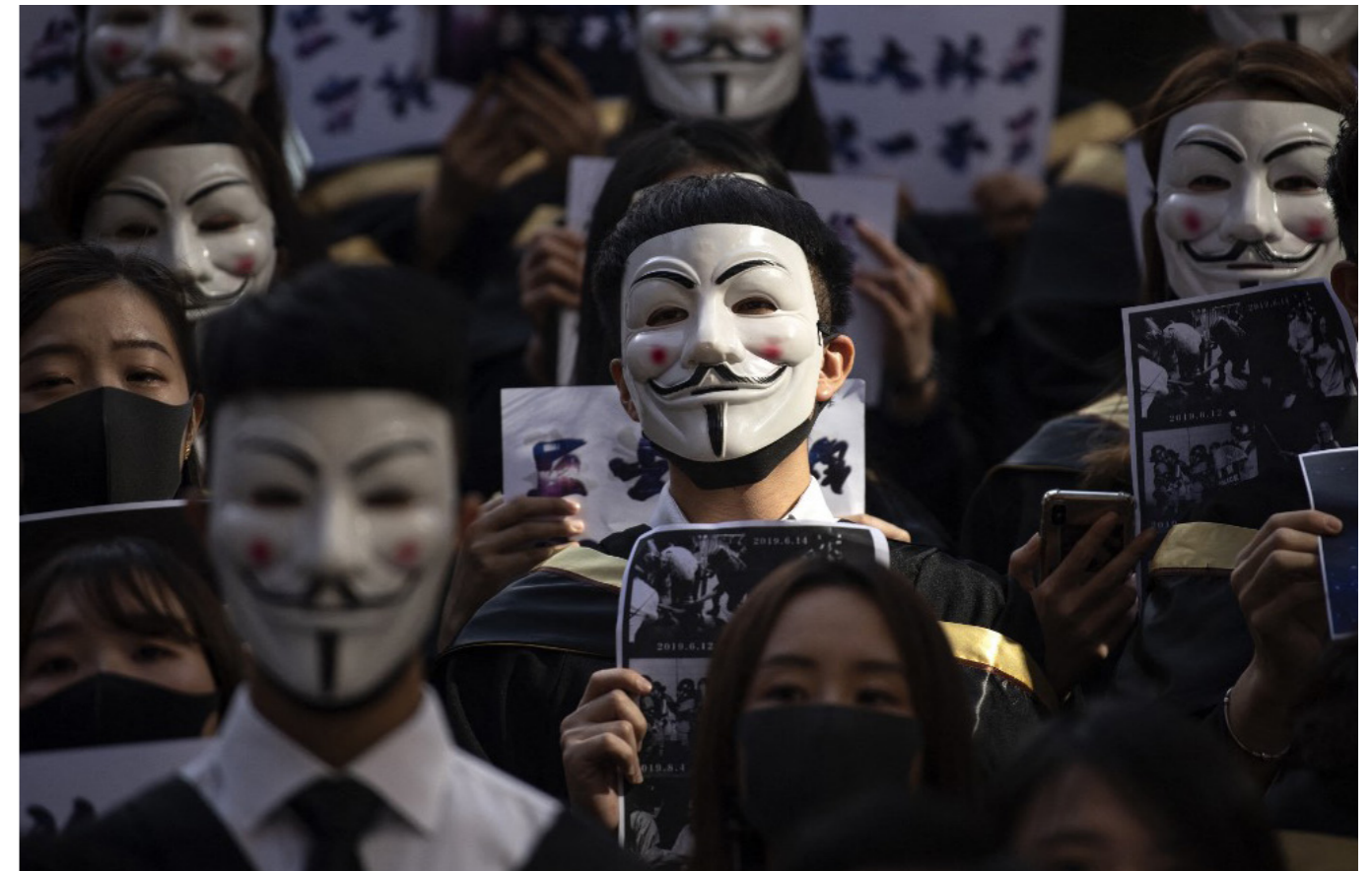
Graduating university students from the Hong Kong Polytechnic University wear Guy Fawkes masks in protest of the colonial-era Emergency Regulations Ordinance which prohibited the use of face coverings at protests.

The election was scheduled for September 6, 2020, and there were widespread expectations that the pan-democrats could win a majority in the legislature. However, new rules stipulating that