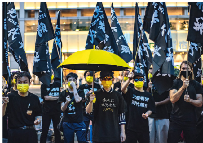
Pro-democracy activists hold a yellow umbrella and flags that read “Free Hong Kong, Revolution Now” outside a train station in Shinjuku district of Tokyo on June 4, 2022, to mark the 33rd anniversary of the 1989 Tiananmen Square crackdown in Beijing.