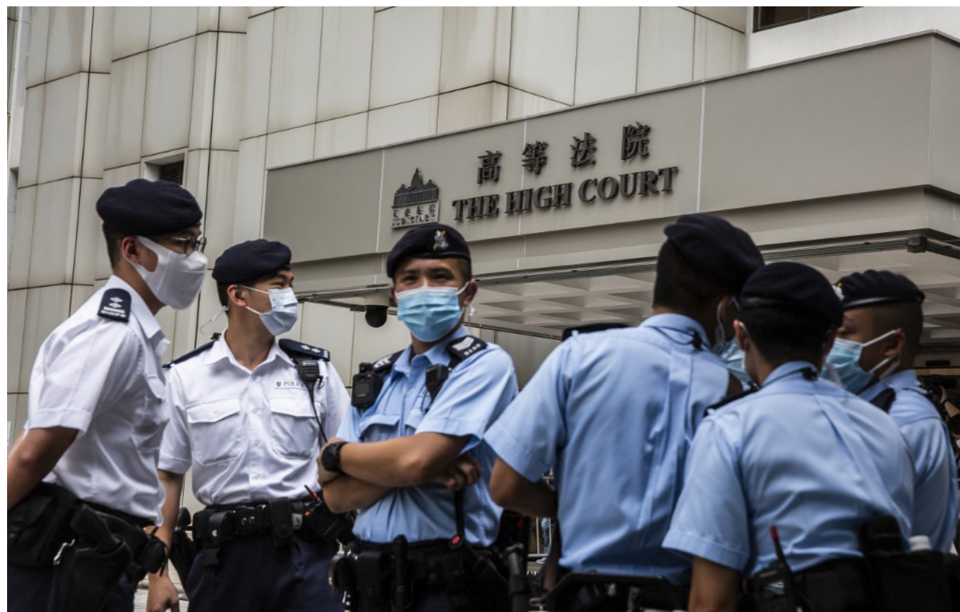
Hong Kong Police officers gather outside the High Court on July 30 for the trial of Tong Ying-Kit, the first person to be tried under the 2020 Hong Kong National Security Law.

hatred, dissatisfaction or hostility in other people against the government or other communities.”