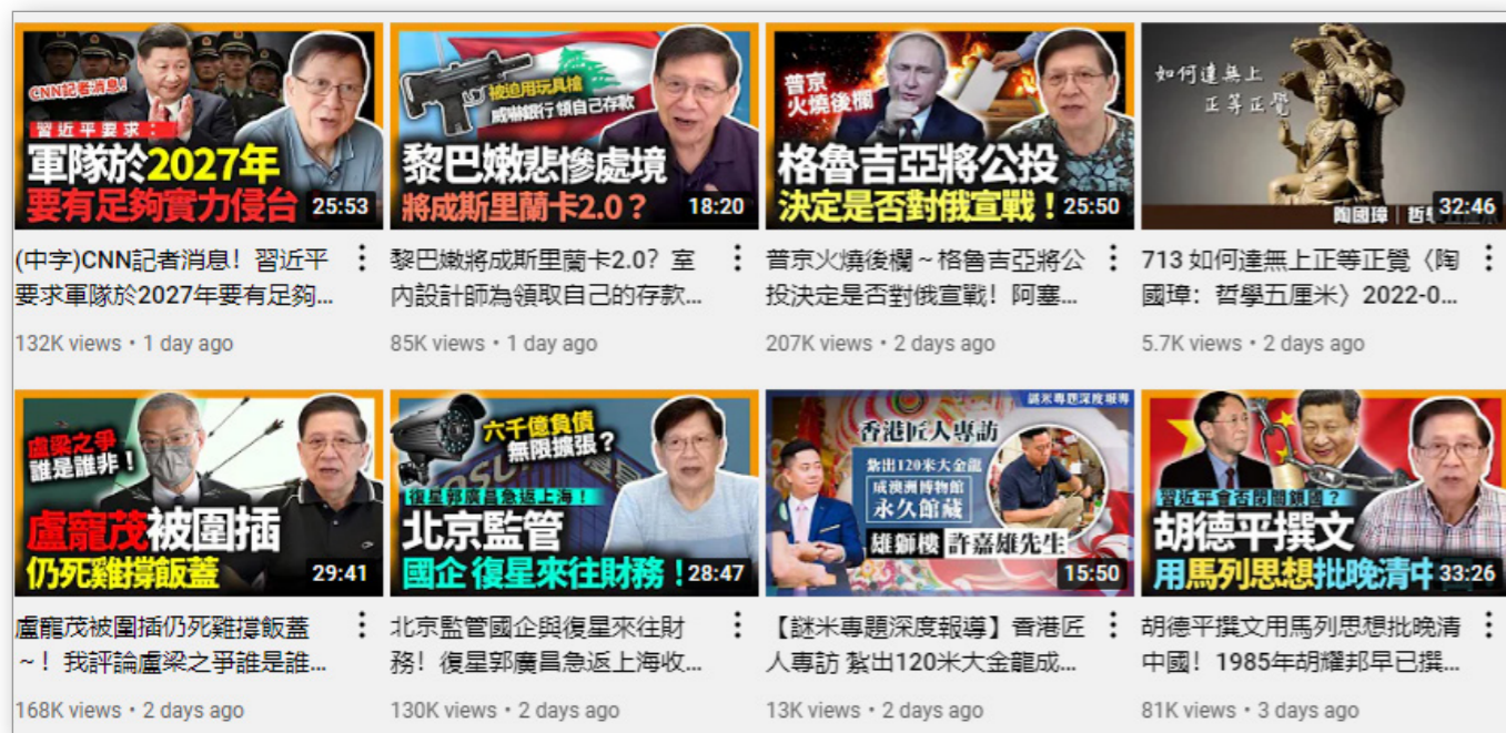
Meme Hong Kong YouTube channel currently has over 846K subscribers and over 1.668 million combined views.

Apple Daily's outspoken criticism of the Chinese Communist Party helped cultivate a culture of defiance and won it the description of being Hong Kong's "largest pro-democracy newspaper" among US and British publications.