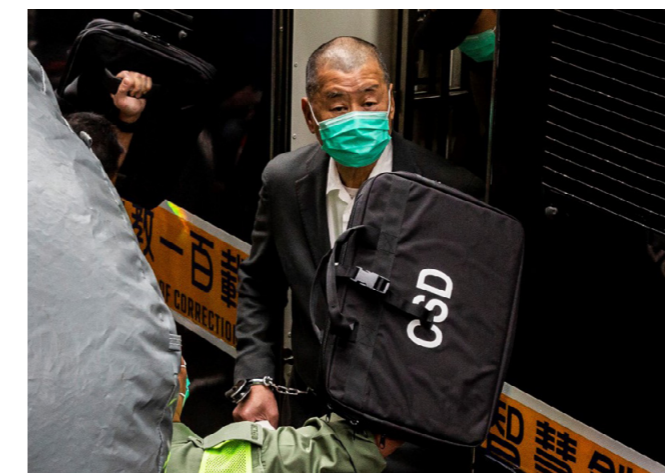
Media Tycoon and Apple Daily founder Jimmy Lai was sentenced to 14 months in prison in April 2021 for his role in 2019 pro-democracy protests.

The campaign alliance, including the HKJA and legislators, argued that the government's approach was "fundamentally inadequate" and worried that an administrative code of practice could be scrapped or ignored at will. Moreover, the ombudsman, the Commissioner for Administrative Complaints, has no powers to force the government or public bodies to release documents or information.