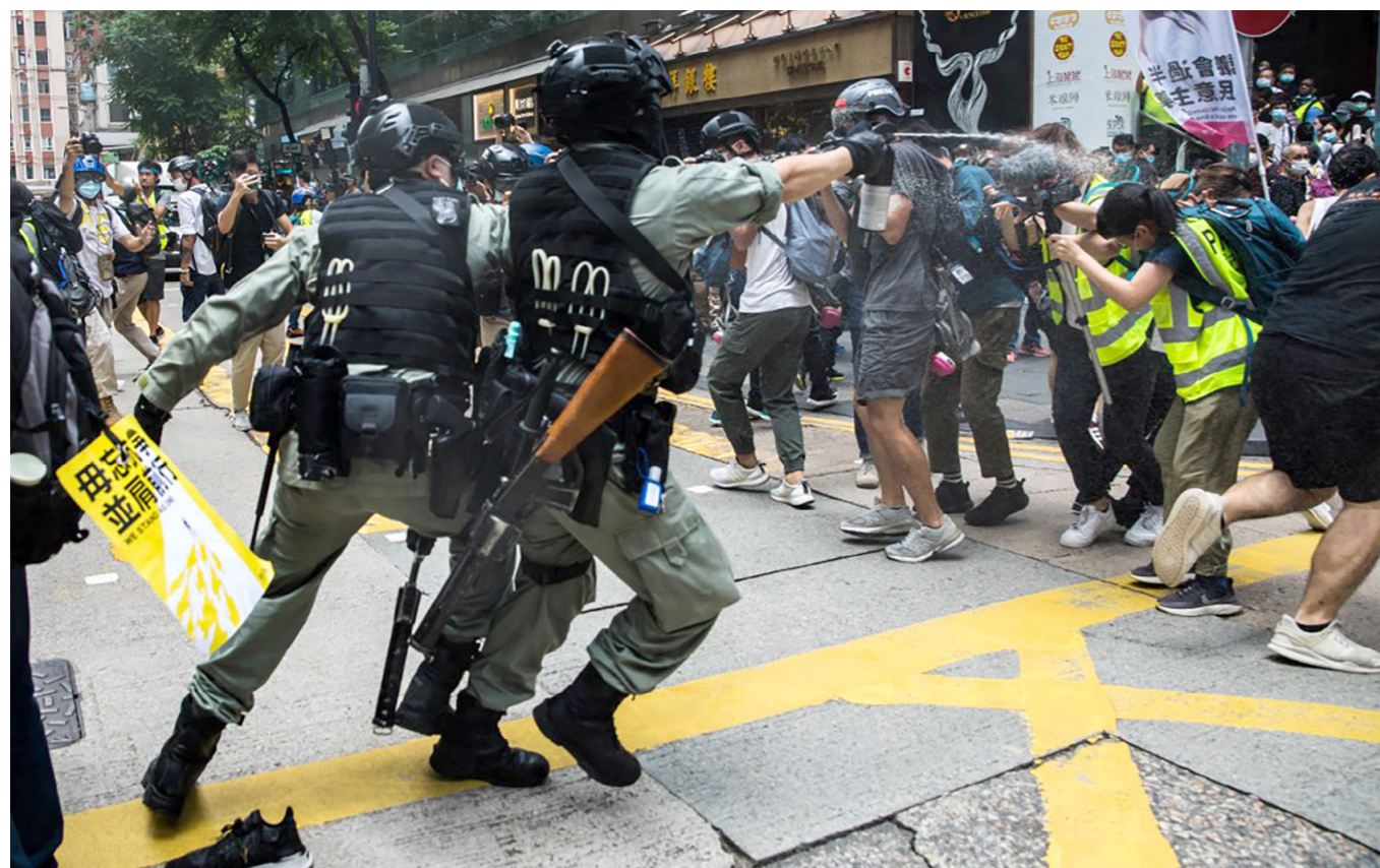
Riot Police deploy pepper spray towards journalists during a demonstration against the 2020 National Security Law. Since the introduction of the law Hong Kong has seen a crackdown on press freedom, independent media and pro-democracy activists.

Ordinance. Another eight were either arrested or placed on wanted lists for sedition because of their media work.