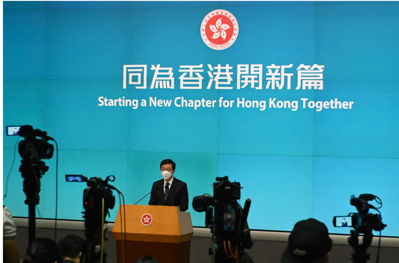
Current Chief Executive of Hong Kong John Lee speaks at a press conference in the Central Government Office in June 2020. Vetted by Beijing, John Lee was the only candidate in Hong Kong's 2022 election in May.

The UN Human Rights Committee this year urged the Hong Kong government to repeal the National Security Law and the sedition provisions of the Crimes Ordinance and to “refrain from using them to suppress the expression of critical and dissenting opinions”. The remarks were contained in the committee’s findings on Hong Kong’s implementation of the International Covenant on Civil and Political Rights (ICCPR), released on July 27, 2022.