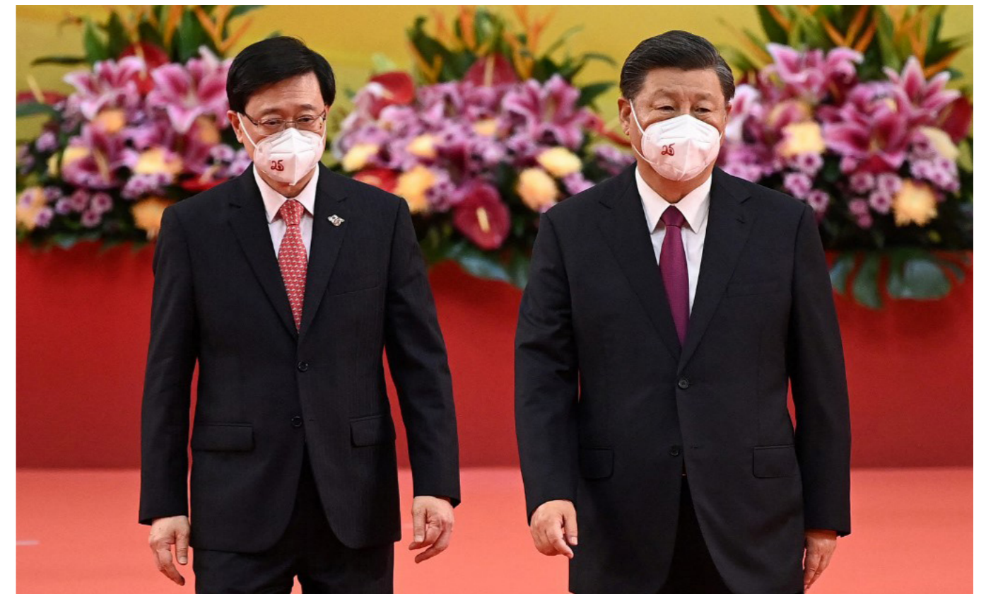
Chinese President Xi Jinping and Hong Kong Chief Executive John Lee stand together at a swearing-in ceremony on the 25th anniversary of Hong Kong’s handover from the United Kingdom to the PRC. Press freedom and independent media in Hong Kong have faced increasing challenges since the passing of authority.

Authorities have used offences under the National Security Law, which was imposed by Beijing in late June 2020, as well as the colonial-era offence of sedition, to target dissent.