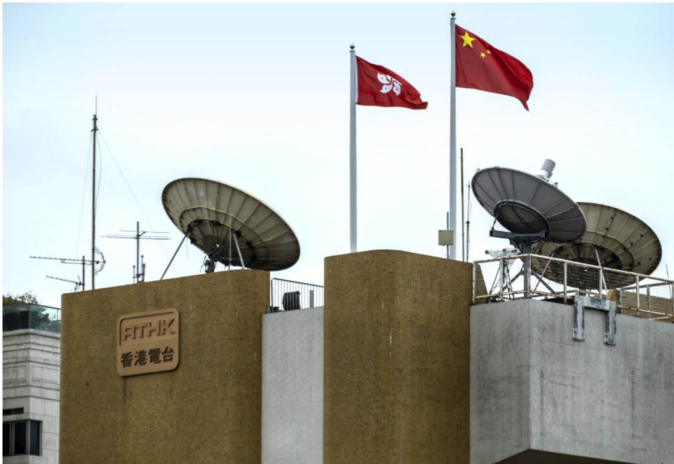
A Hong Kong and China flag flies on top of the RTHK Television House in Hong Kong on April 20, 2021.

development therefore narrowed the diversified environment that Hong Kong once enjoyed.