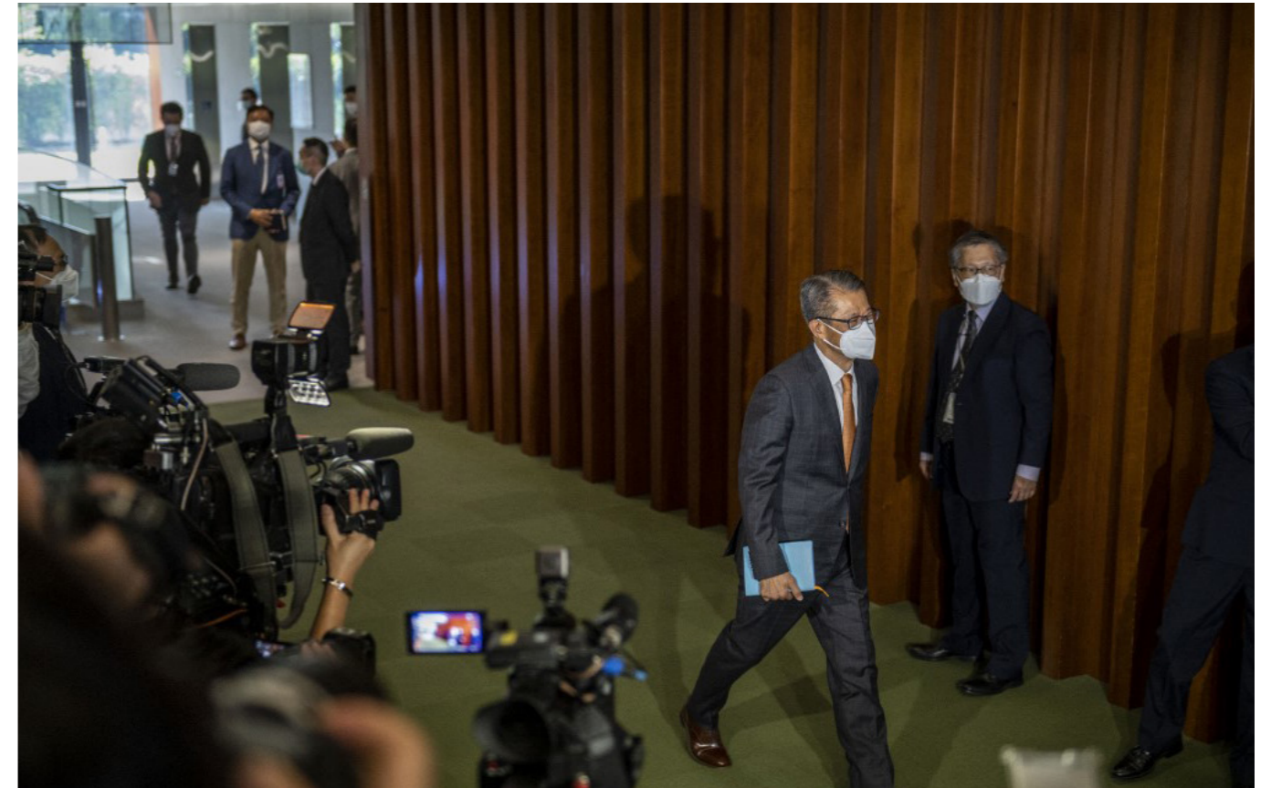
Hong Kong financial secretary Paul Chan Mo-Po Chan sought privileges from the High Court of Hong Kong to liquidise Next Digital following the seizure of the news outlet's assets in June 2021.