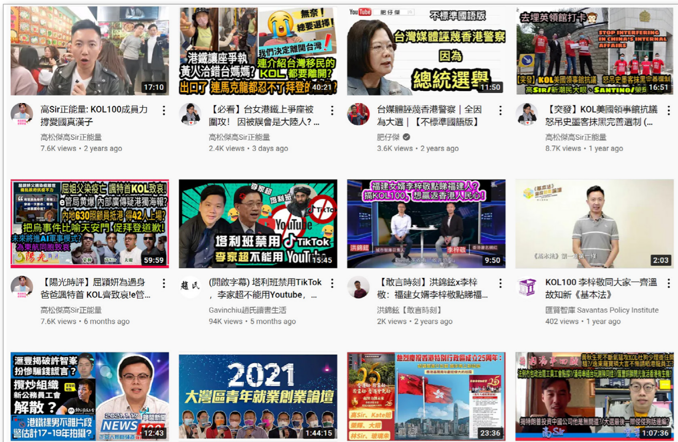
A screenshot from showing search results under the #KOL100 hashtag on October 13, 2022. The KOL100 project was initiated by New People's Party lawmaker Dominic Lee Tsz-king and aims to strengthen pro-government votes through promoting 'key opinion leaders' or influencers.

To reproduce the social and cultural impact on a scale once exerted by the crushed dissenting media outlets may require a new model of operation that can integrate and coordinate the various small news ventures and "self-media".