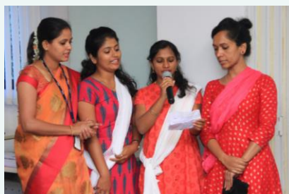
Columbia Sportswear Company Peer Educators sharing success stories and experience from the training ( left ) and receiving a certificate ( right ) at the closing graduation ceremony.

Since its commitment, Columbia Sportswear Company has enrolled three new factories in BSR’s HERproject in Vietnam and two in India, reaching a total of 6,700 workers, including 5,300 women workers – and a total of 45,000 women workers since it started programming in 2008. COVID-19 has disrupted factories to a degree that the implementation of