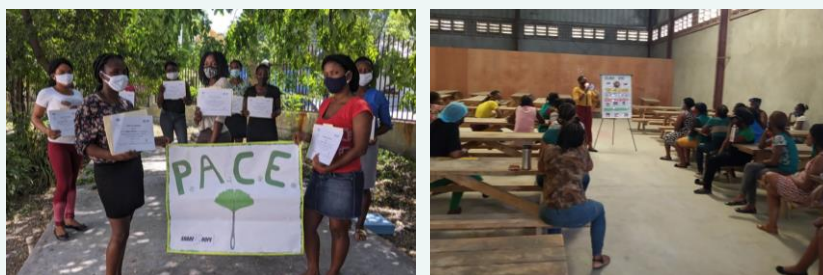
Graduates of the PACE program (left) and a COVID-19 training facilitated by Share Hope.

In March, Share Hope pivoted to information-sharing and raising worker awareness about COVID-19 and how to minimize risk, including through brochures, worker lunches, after-work hours, and certifying staff in WHO COVID-19 prevention curriculum. Share Hope reached 3,000 workers with COVID-19 information and taught the prevention curriculum to 22 nurses working in six factories in Port-au-Prince. Meanwhile, Share Hope is in continued conversations with brands that are operating at factories that are targets for worker health and well-being programs to build support for such initiatives, and is also working to reflect in its hiring practices the goal that all trainers should also be certified nurses.