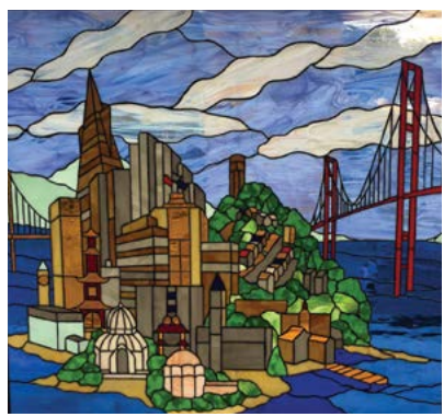
Reshma Bhoopal's artwork includes "Pocket Hugs," top, and a scene of San Francisco, above.