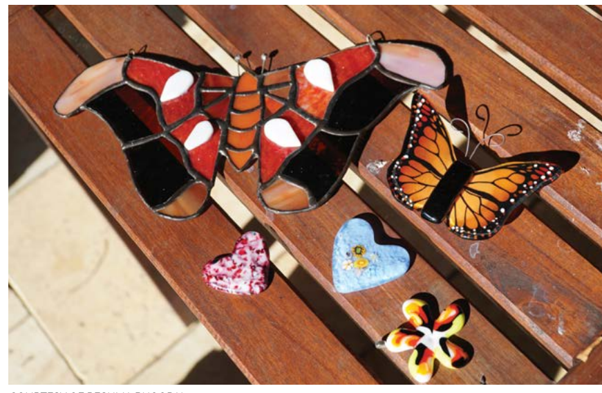
Reshma Bhoopal's stained-glass creations include colorful butterflies and hearts.

Last year, she explored a mushroom and gnome theme where she made mushroom plant stakes and