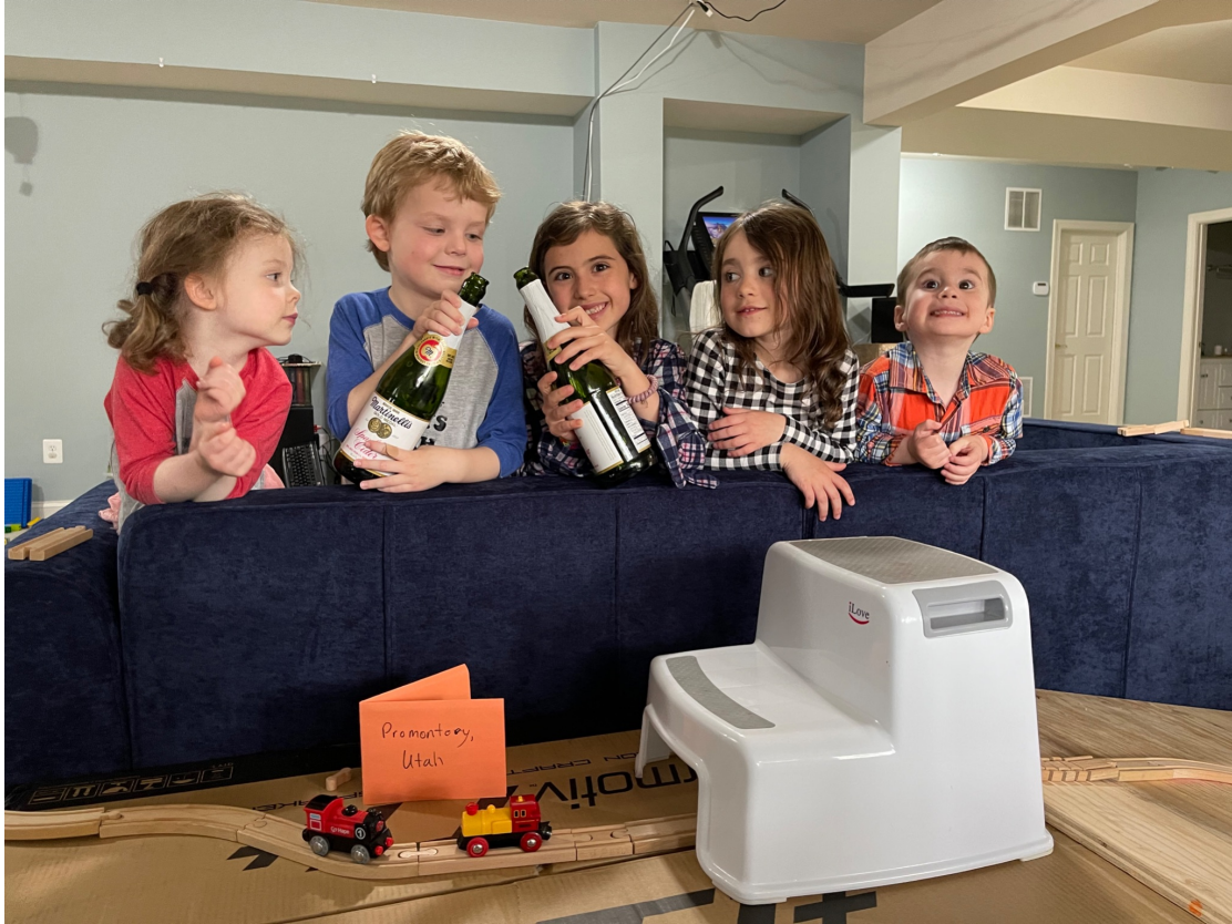
The “Champagne” Shot.