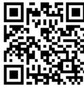
Updated 2024 Exploratory Turf Analysis