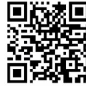
2024 Climate Change in Colorado Report