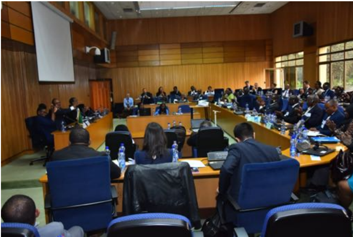
During the closing ceremony - A full house.