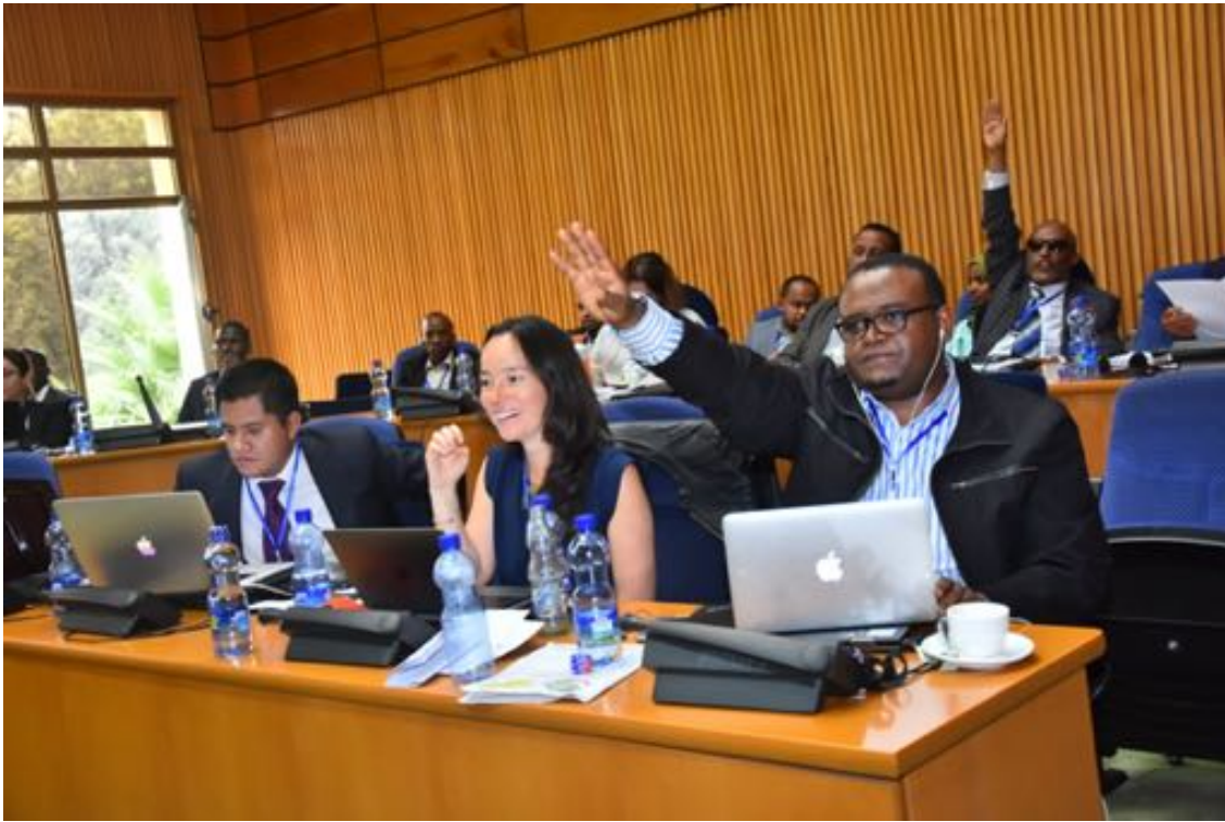
During the floor discussion of the final panel.