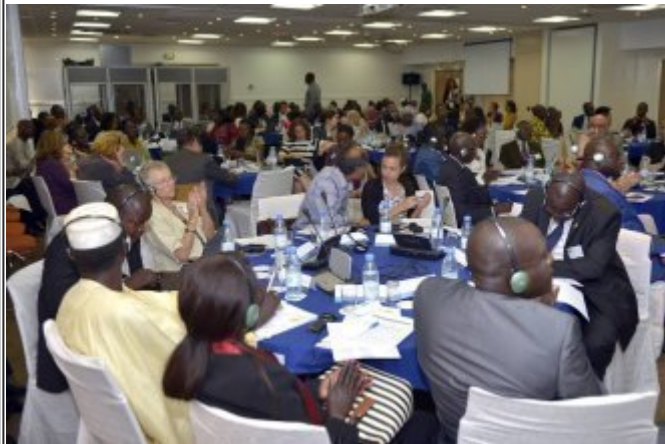
A Full House.