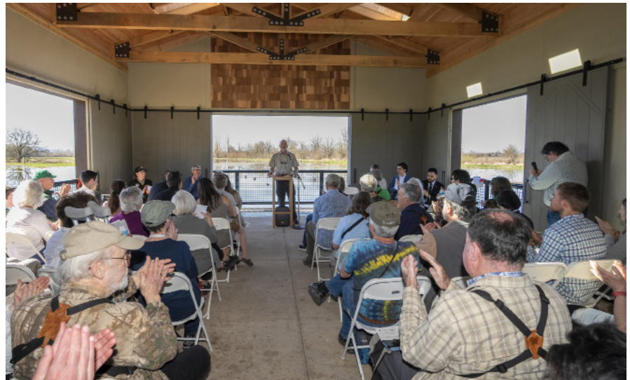
The Outdoor Classroom interior during the wecloming presentation.