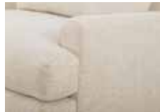
TRACK ARM WITH "T" CUSHION