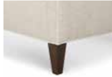
POST NO CASTER