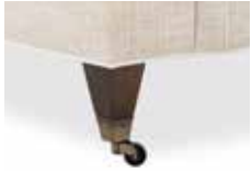
POST WITH CASTER