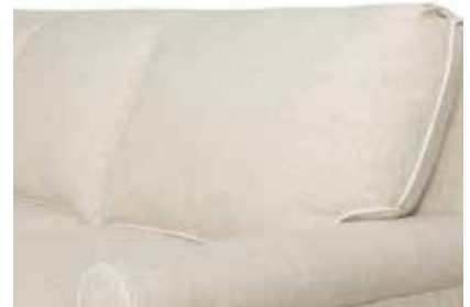
KNIFE EDGE BACK