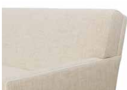
MODERN TIGHT BACK