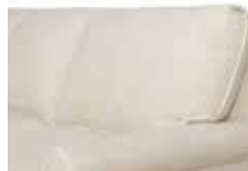
KNIFE EDGE BACK