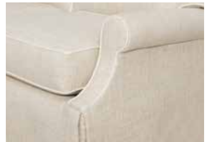
RECESSED SOCK ARM