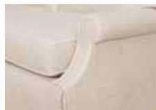
RECESSED SOCK ARM