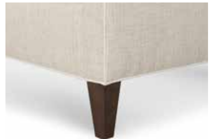
POST NO CASTER