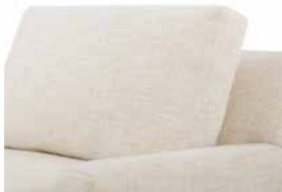
STRAIGHT BORDERED BACK