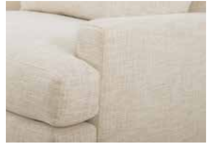
TRACK ARM WITH "T" CUSHION