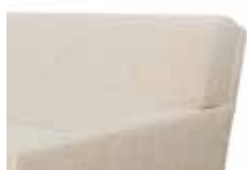
MODERN TIGHT BACK