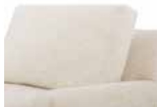
STRAIGHT BORDERED BACK