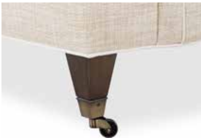
POST WITH CASTER