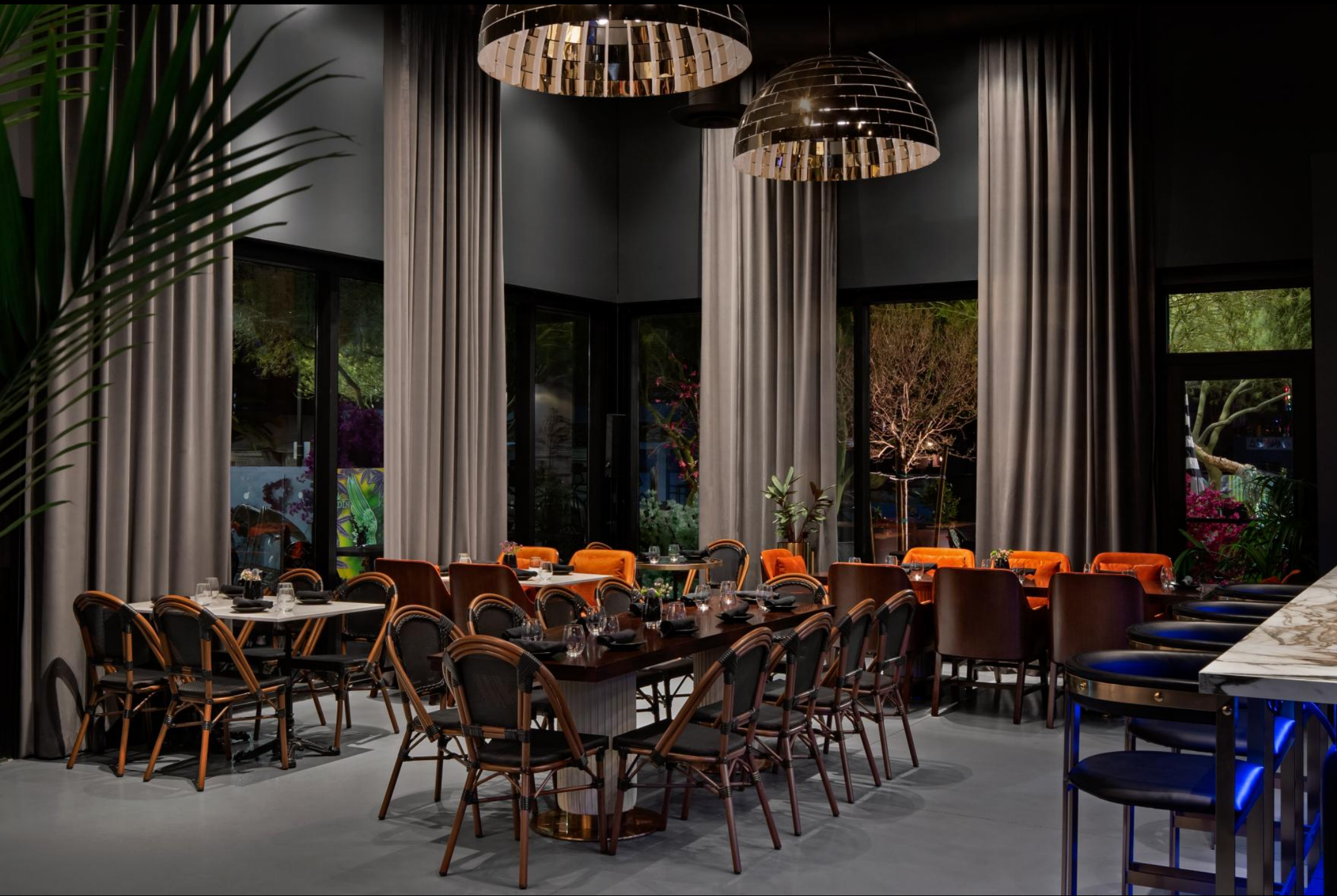
FRONT SECTION SEATS 10-50