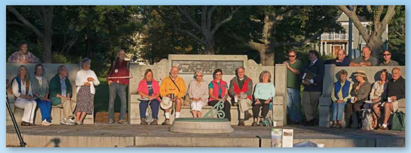
The sun shone brightly on early risers who kicked off the Baxter Day celebration at the sundial on Baxter Boulevard, some of whom lingered for a photo after the ceremony.