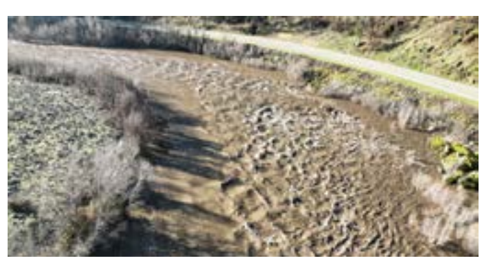
The turbid Klamath River on January 30, 2024, about <sup>1</sup>/<sub>4</sub> mile below the mouth of the Scott River and 50 miles below the lowest dam site. Salmon juveniles that leave the refuge of the Scott and Shasta rivers to migrate to the ocean via the Klamath may not survive such turbidity. This includes the ESA-listed coho salmon.

Ironically, dam removal proponents claimed the project would help salmon, but now the Klamath River is being polluted with millions of cubic yards of decomposed algae, organic deposition, chemicals, and fine silt that has built up behind the dams. Dead steelhead trout and other species are floating to the banks. Any salmon spawning beds in the Klamath River were undoubtedly destroyed. At press time, conditions in the Klamath River were not likely survivable for the salmon juveniles that were beginning to emerge from