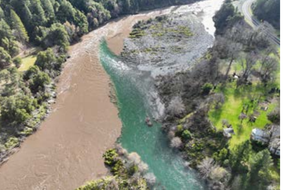
Clear Creek is a tributary that joins the Klamath River near Somes Bar, about 90 miles below the dams. This photo was taken on January 30th, 2024, seven days after the last dam, Copco No.1 was breached.