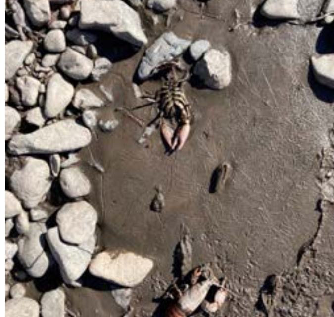
Dead crayfish in the Klamath River about five miles downstream of the now-breached Iron Gate dam, February 11, 2024.

But of even greater concern is the "food web," the millions of organisms in the river that all species rely upon for life. How much of it has been (and will be) destroyed in the Klamath? When will it recover? There may be no food web to support adult salmon returns for many years.