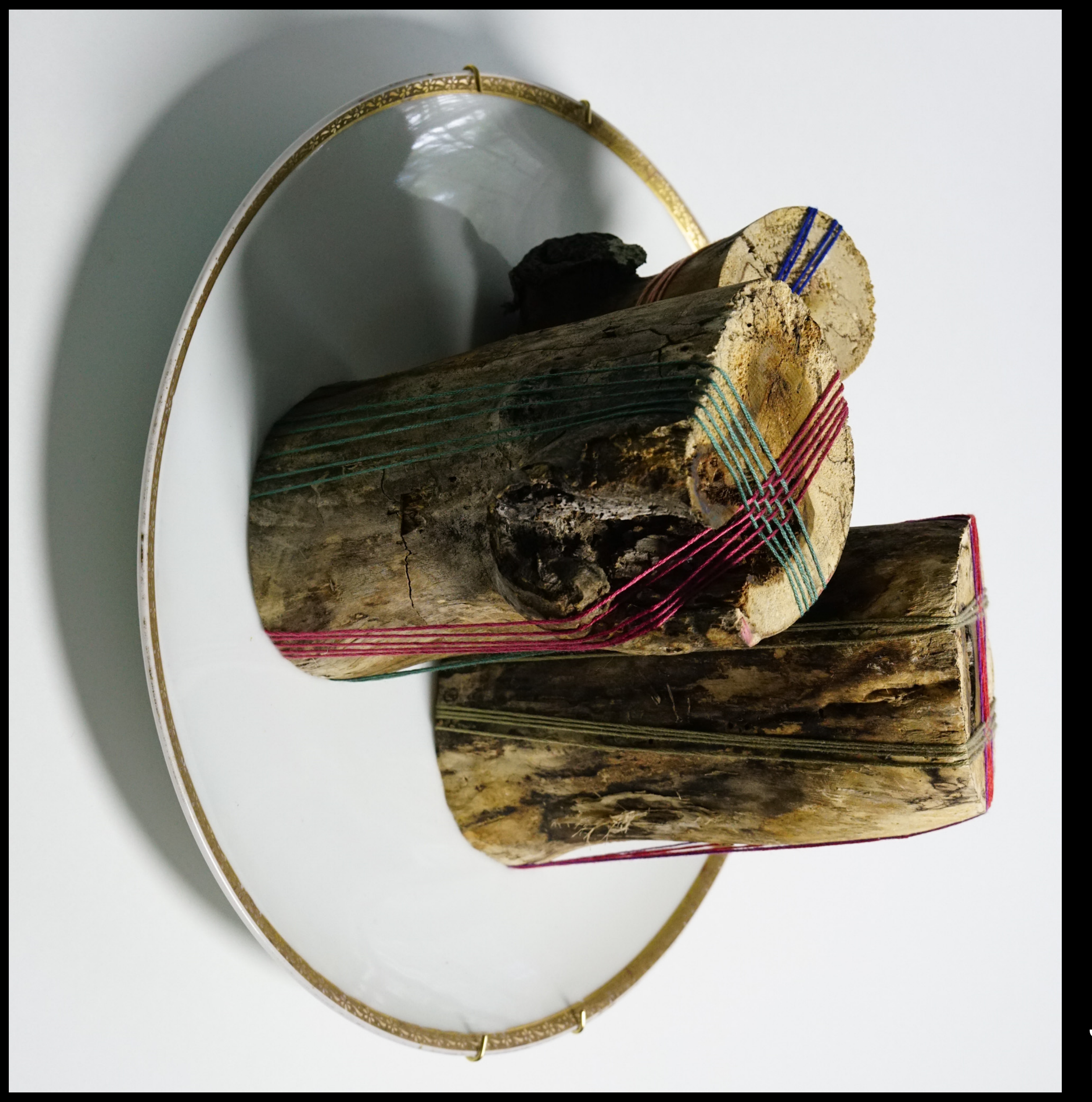
Stick Weaving I: Plate Metal, 2022, Handwoven logs and vintage plate