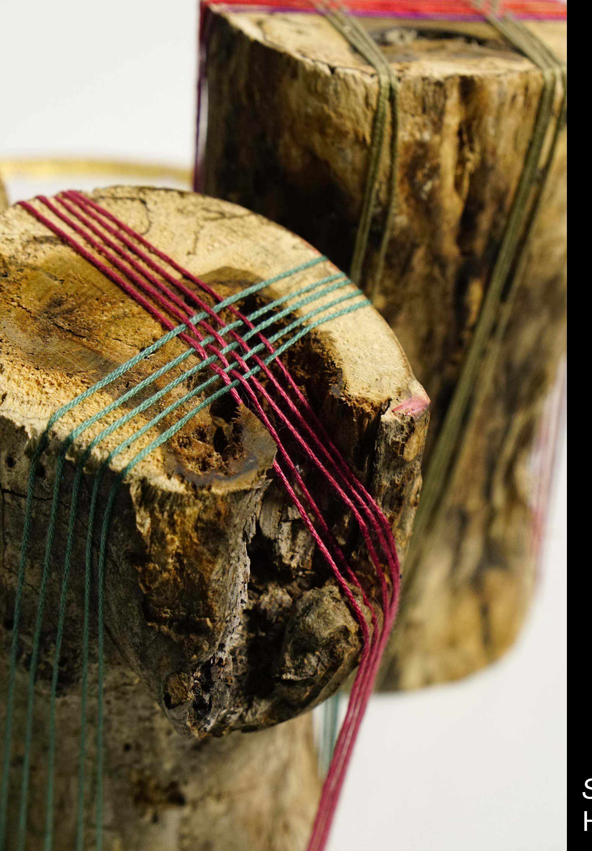
Stick Weaving I: Plate Metal, (detail) 2022, Handwoven logs and vintage plate