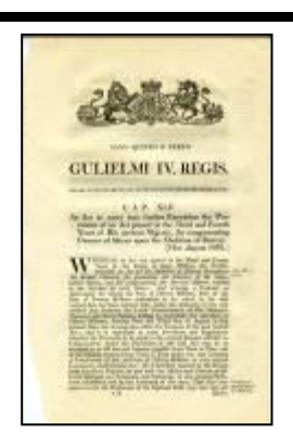
Ref. AN/2 Ref. PRINTS/35