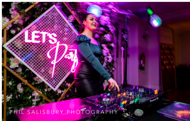
PHIL SALISBURY PHOTOGRAPHY