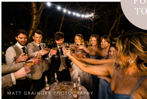
MATT GRAINGER PHOTOGRAPHY