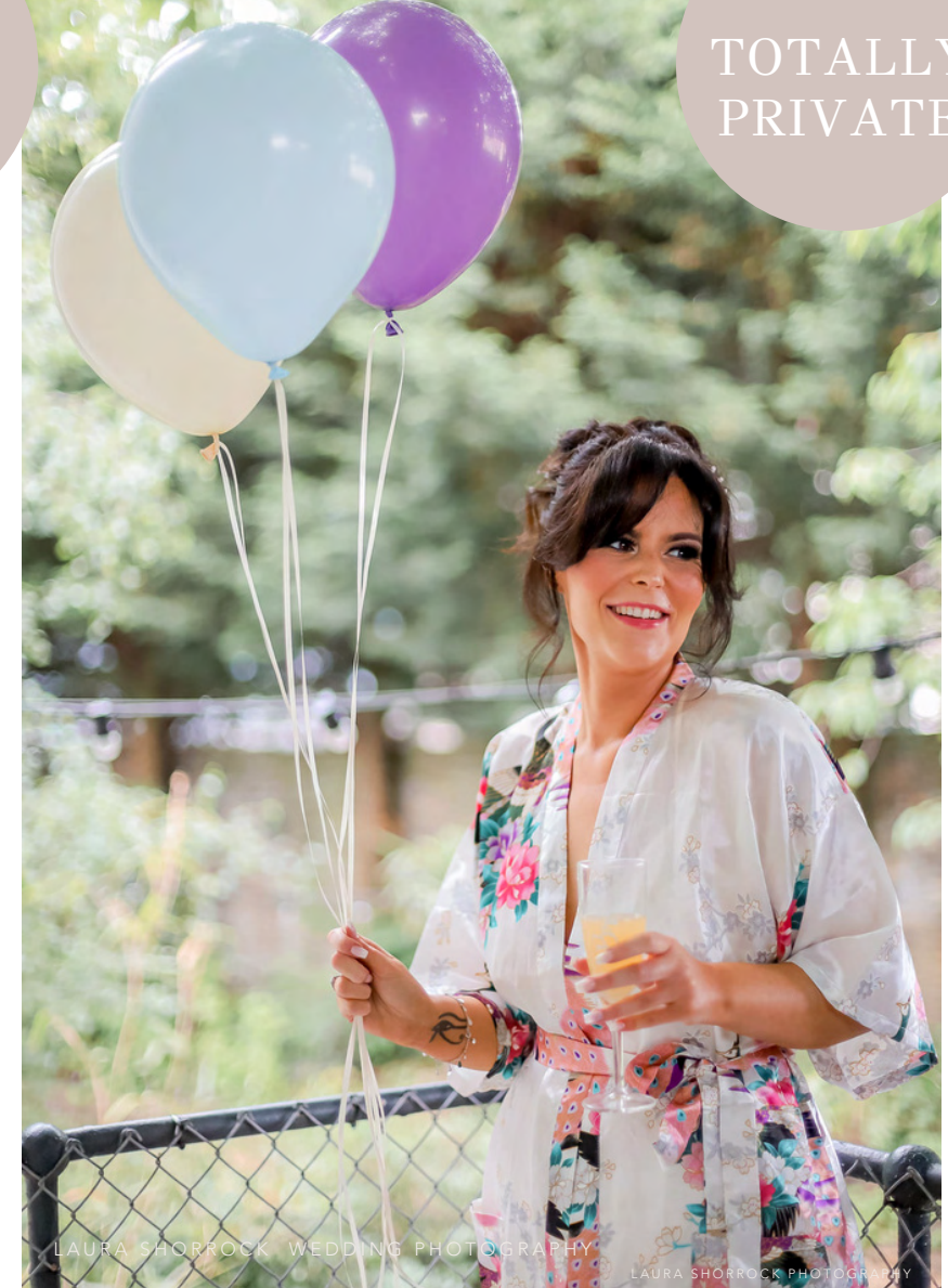
LAURA SHORROCK WEDDING PHOTOGRAPHY