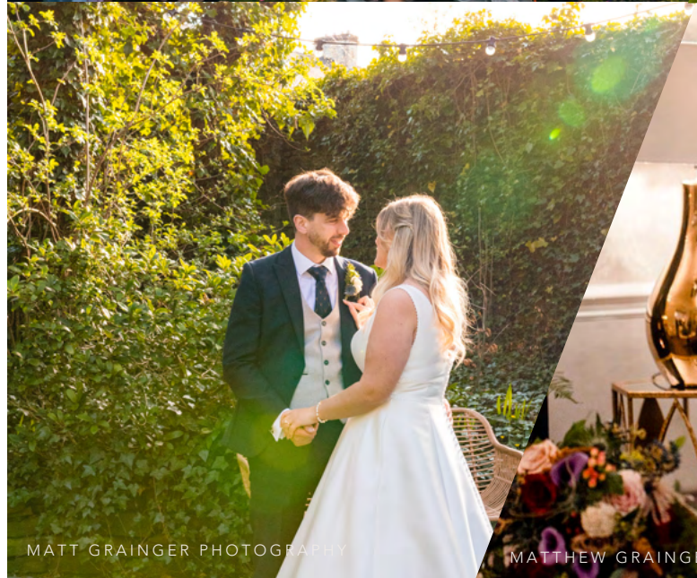
MATT GRAINGER PHOTOGRAPHY