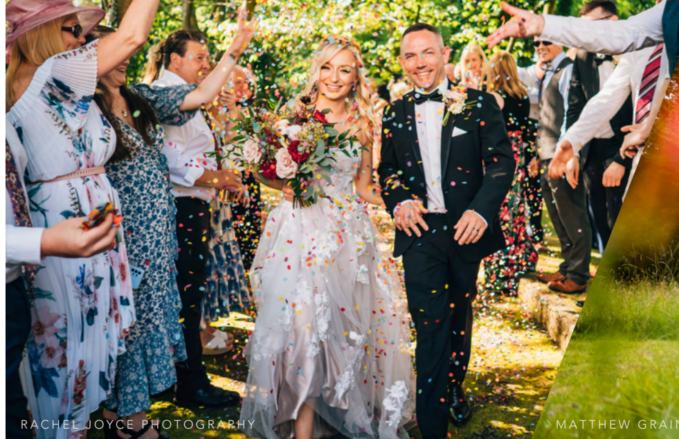
RACHEL JOYCE PHOTOGRAPHY

Fairy lights and festoon lighting help capture your day in the most whimsical, magical way. With quaint spots for those 'just us' memories and large lawns for the ultimate big group shot.