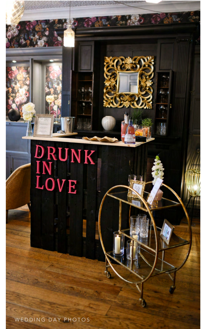
WEDDING DAY PHOTOS