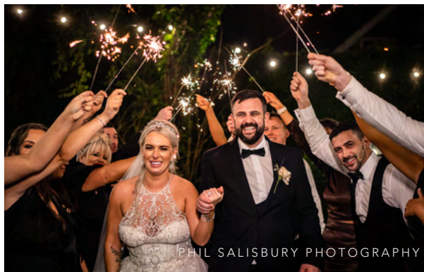
PHIL SALISBURY PHOTOGRAPHY