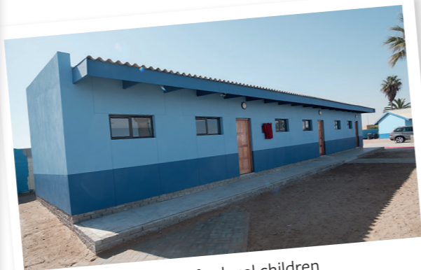
Classrooms for local children

Fair trade charcoal will be available to purchase in Co-op stores from March onwards. Read more about the impact on Co-op's website here - at coop.co.uk/our-suppliers/fairtrade/fairtrade-charcoal/