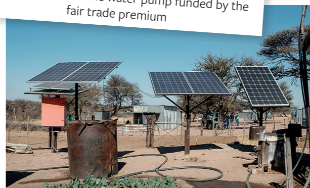
Solar panels to provide power and lighting for charcoal workers

We're excited this work can continue the legacy and impact of Traidcraft in a practical, powerful way.