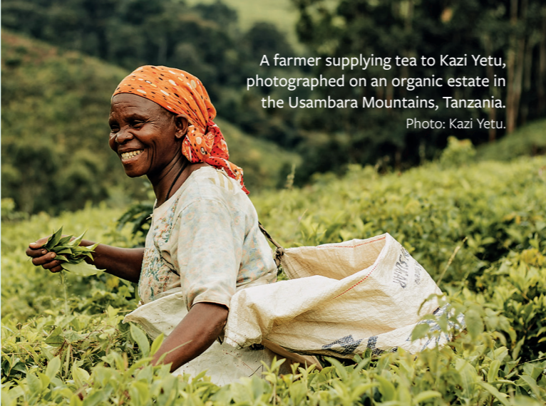
A farmer supplying tea to Kazi Yetu, photographed on an organic estate in the Usambara Mountains, Tanzania.

From a trade justice perspective, the labour rights of those who tend and harvest the tea leaves is the big question. Big tea brands dominate the tea industry, buying from tea estates where conditions are notoriously poor, workers and their families' housing situation ties them to working on the estates, and exploitation is hidden from sight behind the gates around these vast plantations (many of these plantations are legacies of British colonial land grabs). There have been many cases of alleged serious human rights abuses on tea estates in India and East Africa.