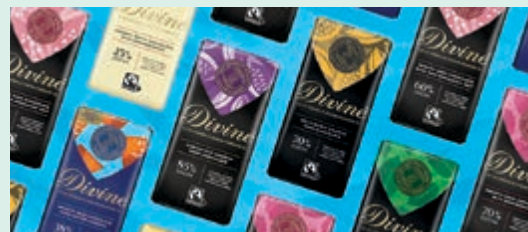
Delicious chocolate from divinechocolate.com