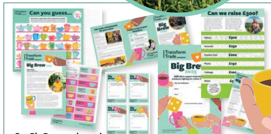
Our Big Brew pack 2025!

It's not too late to get your hands on one – simply contact us at hello@transform-trade.org or find digital resources at transform-trade.org/big-brew