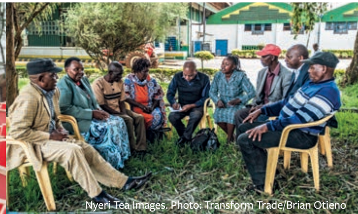
Nyeri Tea Images.