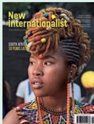
A hamper worth £200 – full of cards, a One World Calendar, Almanac, magazines, books and lots more from www.ethicalshop.org

These are just a few of the prizes up for grabs – see them all at transform-trade.org/raffle