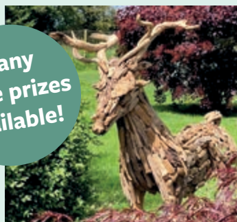
A driftwood animal & home goods from sharedearth.co.uk