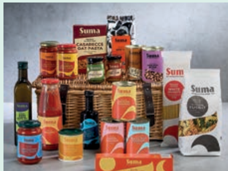
An Italian food hamper from suma.coop

Every ticket directly funds our work in Kenya, Tanzania, India and Bangladesh – working hand in hand with producers to create effective solutions which allow producers to thrive in difficult circumstances.