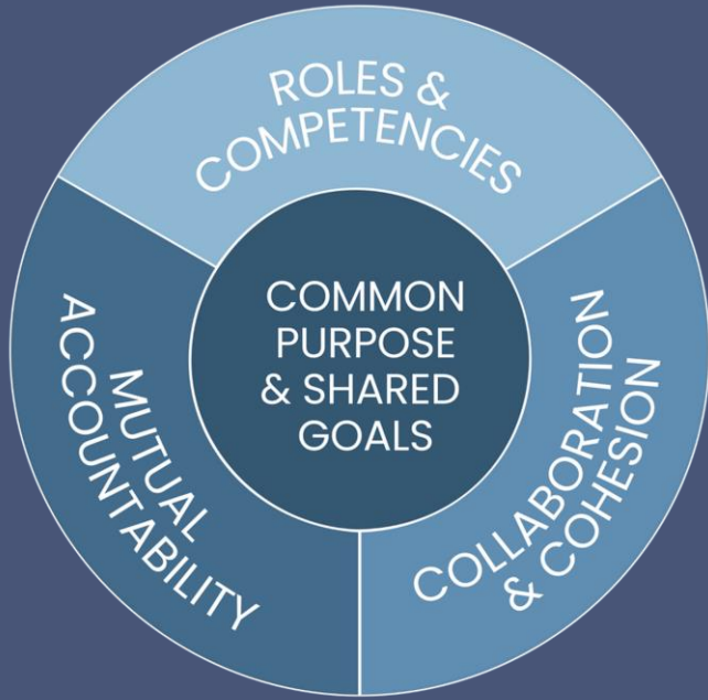
The Corentus Team Wheel™ Key Dimensions of Team Effectiveness