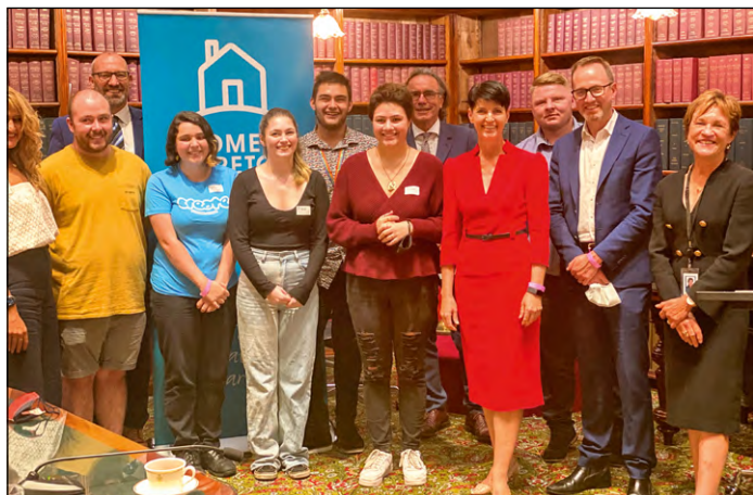
■ I organised a bipartisan forum in NSW Parliament.

Victoria have raised the age to 21. It's time for NSW to follow suit.