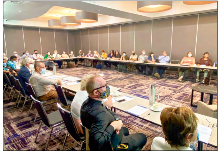
■ Griffith Housing Forum.

I’m in contact with Councils to scope out available land. This is an issue I’m keen to get firm commitments from the NSW Government as soon as possible.