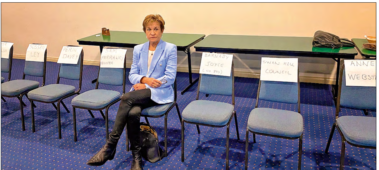
■ A number of MPs were invited to an emergency meeting but didn't turn up

The NSW Government promised this community a new bridge in 2012. I intend to hold the Government to their commitment.