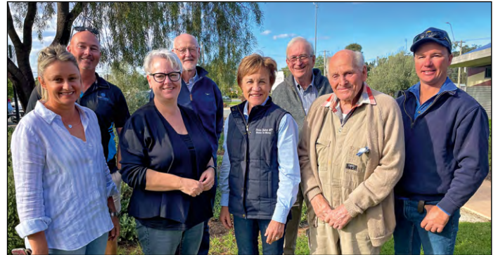
■ I introduced the newly formed Yabba for Yanga Group to the shadow environment minister.

Join the "Yabba for Yanga" Facebook group to support their fight.