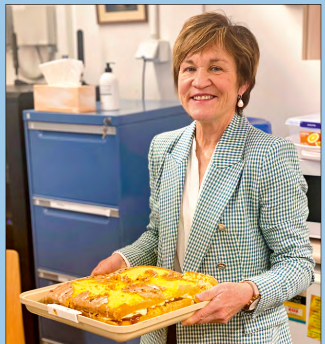
■ My famous sponge cake.

In 2020, my ex-party conducted a "focus group" to test what people think of me. One guy in the focus group said he thought I was "too aggressive." I totally disagree. In fact, I often bake sponge cake and bring it to work. My staff all love it. If they don't, I smack 'em upside the head.