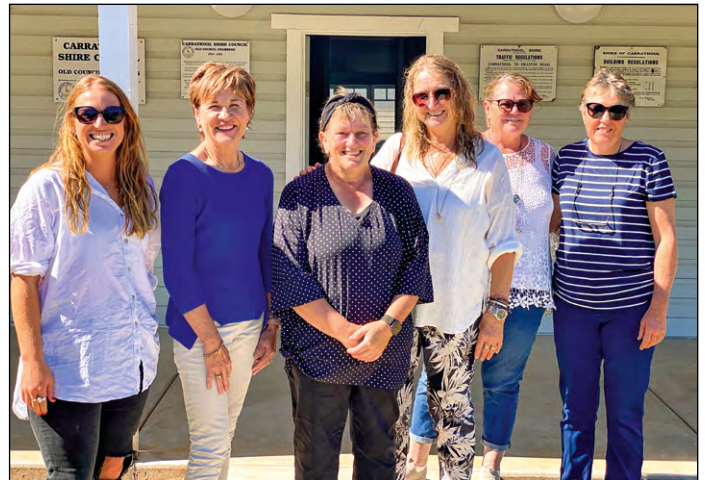
■ Counselling Rooms in Goolgowi.

My office will continue to support this wonderful community-driven initiative. The next goal is to get ongoing funding from the NSW Government to make the centre a continued success.