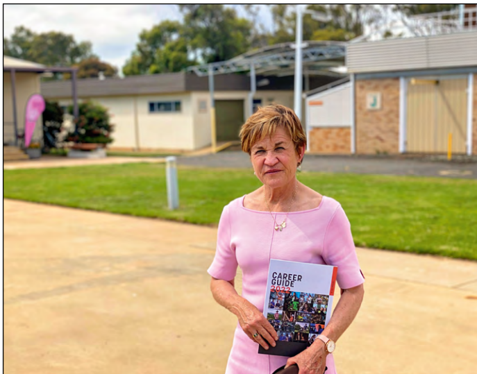
■ I hope the buildings behind me are not sold off by the Government.