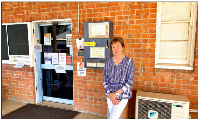
■ The old hospital certainly needs an upgrade.