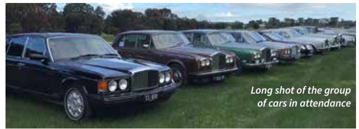
Long shot of the group of cars in attendance

Something you don't see every day is a house being transported by road. This necessitated all of us to overtake the very wide and long truck whilst still trying to keep in the motorcade. Then a Member, who shall remain nameless, gave his Bentley Brooklands "its head" and roared off forcing all of us to try and keep up. The prescribed turn-off to Hamilton and Fyansford which would take us through rolling country roads to Inverleigh was looming up all rather quickly and we passed it just as quick!