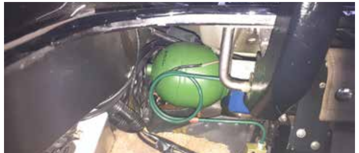
Mark and Terry Herbstreit start on the laborious task of removing the suspension spheres which are well hidden behind a panel and hydraulic pipes in the boot

So we now have Don's Spur on the hoist and Mark and Terry Herbstreit's first task was to remove the panelling inside the boot to gain access to the suspension spheres and as usual, accessibility is always hampered by hydraulic pipes etc. With incredible luck, the Spheres were not over tightened and once nimble fingers gained purchase of the item with the correct chain tool, they were removed without major trauma.