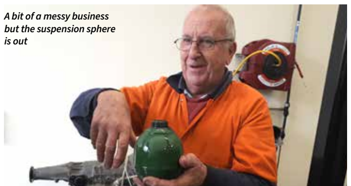
A bit of a messy business but the suspension sphere is out

The lads were also relatively lucky with the brake spheres which were located on the lower left bank of the engine block, still hard to get to but once the tools were in place, they were also extracted without too much difficulty.