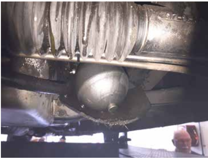
Now for the brake spheres. The second one is hidden right behind