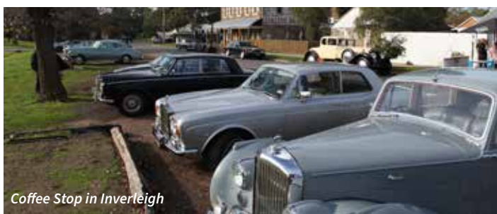
Coffee Stop in Inverleigh