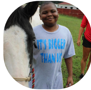
Camp Cole Weekend Retreat