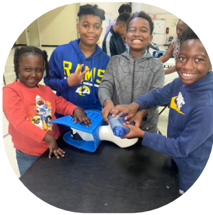
CPR & First Aid