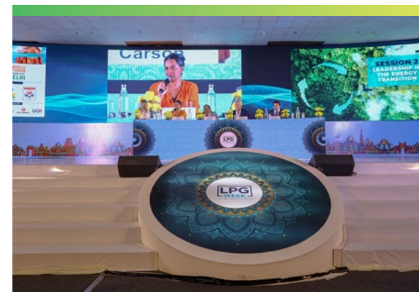
LPG Week, New Delhi, Energy Transition Panel.

GasNZ (via the Gas Association membership prior to merger) was delighted to welcome its first renewable gas companies: Biogas company Ecogas and hydrogen start-up H2X to GasNZ.