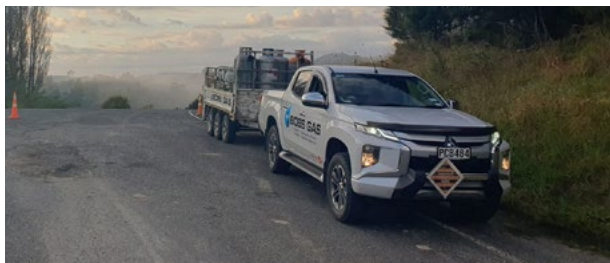
Bob's Gas using a four-wheel drive to get LPG cylinders to parts of Te Tairāwhiti inaccessible to normal delivery trucks.

LPG is playing a vital role as a versatile, mobile fuel for cooking and water heating, and will continue to do so in the ongoing recovery.