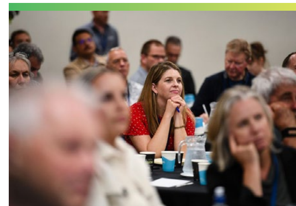
Te Aō Hurihuri , Gas Forum 2022, Wairakei Hotel.

While GasNZ is not required to report on these committees in this annual report, a snapshot of GANZ's committee work over the last year is included in the technical committee section, pages 9–10 , as our current members will be interested in their work programme.