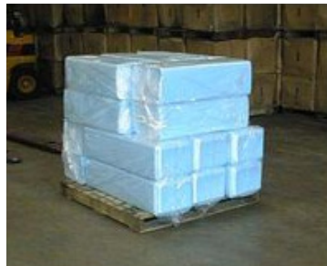
Exposed, Expanded Plastic