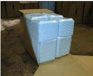
Cartoned, Expanded Plastic