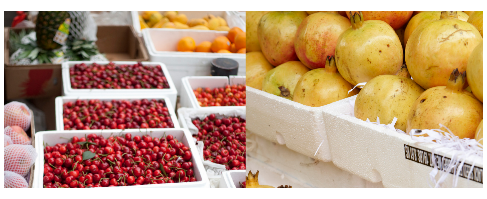
Table 3. Water Absorption and Vapor Transmission

Fruits and vegetables stored in EPS boxes retain a greater level of Vitamin C than other packaging materials, as reported by the Korea Food Research Institute.