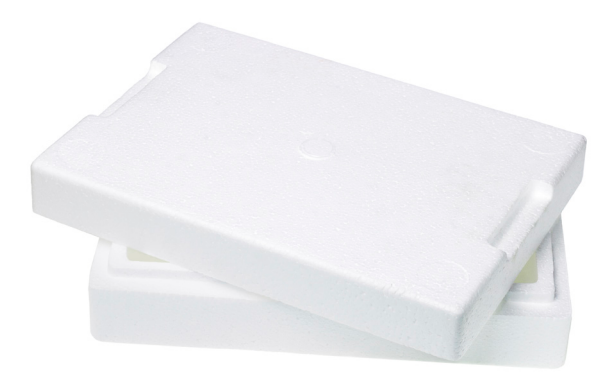
Expanded polystyrene manufacturers use pentane as its primary blowing agent. EPS transport packaging has never been made with CFCs (chlorofluorocarbons) or HCFCs.