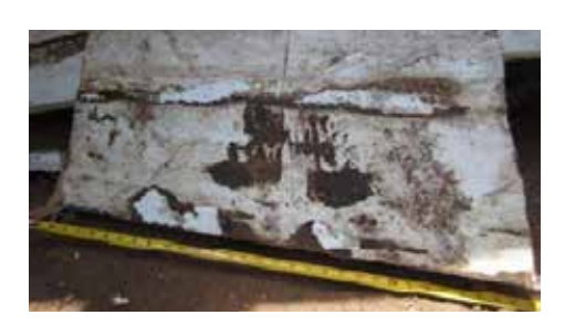
Below Grade Insulation St. Paul, MN