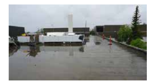
Roof A Wasilla, AK