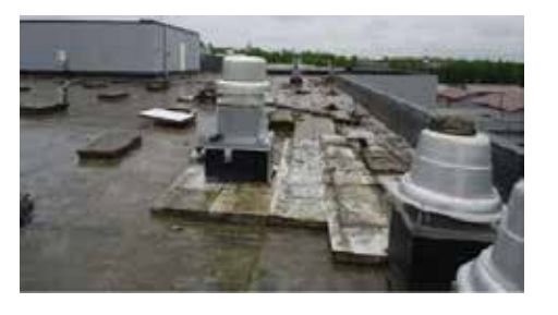
Roof B Wasilla, AK