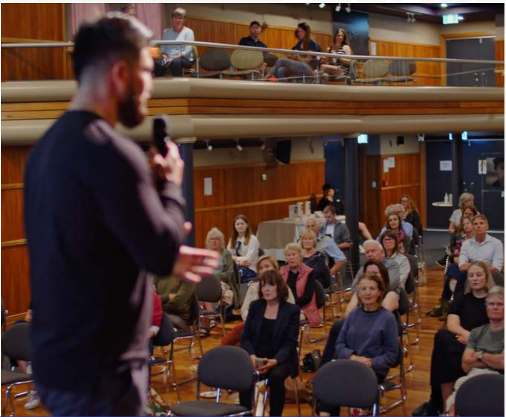
FEATURING IN BOTH WĀNAKA & QUEENSTOWN