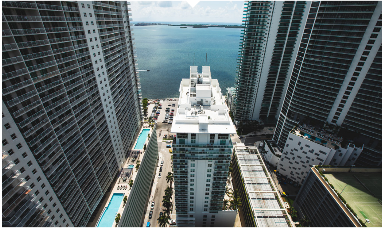
VIEWS FROM THE 25 TH FLOOR