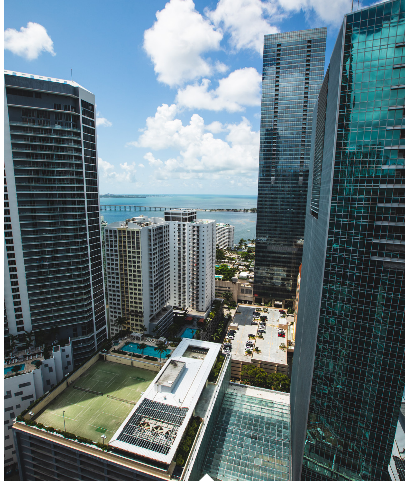
VIEWS FROM THE 25 TH FLOOR